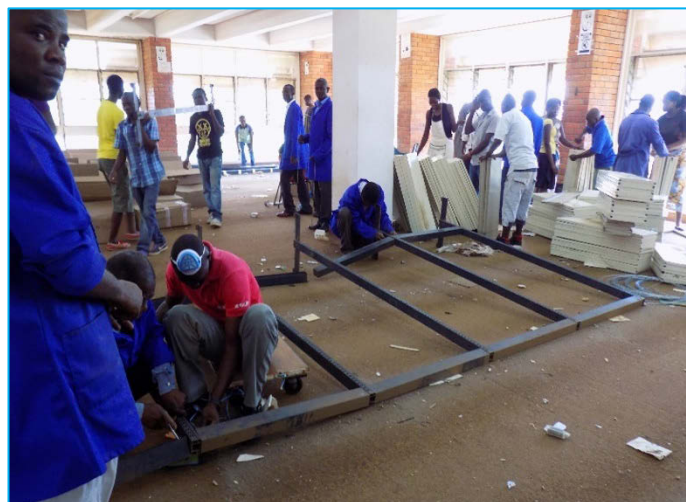
Book shelves being dismantled and moved out of the library for safe keeping

Since December, library staff have systematically packed the library books for safe keeping while the renovations are taking place.