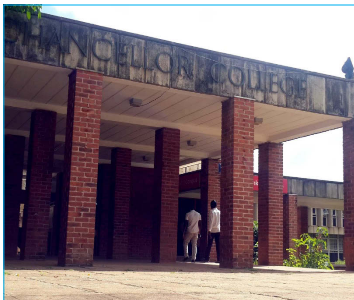
The face of Chancellor College

Developments such as these are part of the change we want to see at Chancellor College. All it needs is our united effort. We can achieve this and more in 2016.