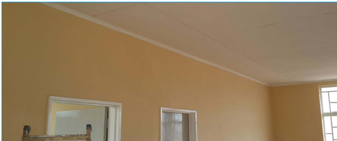
A section of one of the newly painted rooms

It is also important to note that an MOU has been developed to guide the two institutions on the running of the site. Currently the Ministry of Justice and the UNIMA Legal counsel are working on the MOU. All things being equal, launch of the site is planned to take place in February, 2016 in Mzuzu.