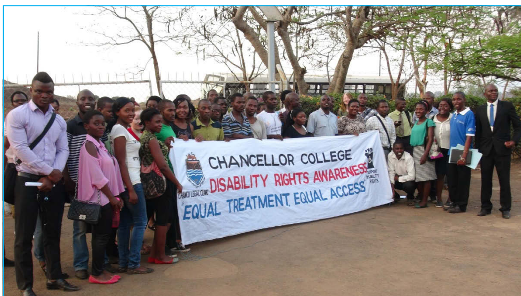
The team from the Law faculty, upon arrival at Kamuzu Vocational Rehabilitation and Training Centre

Under the same program, the Faculty was able to hold a Disability Rights Conference on 1st December, at Malawi Sun Hotel. The conference was attended by staff, students, and members of the public.