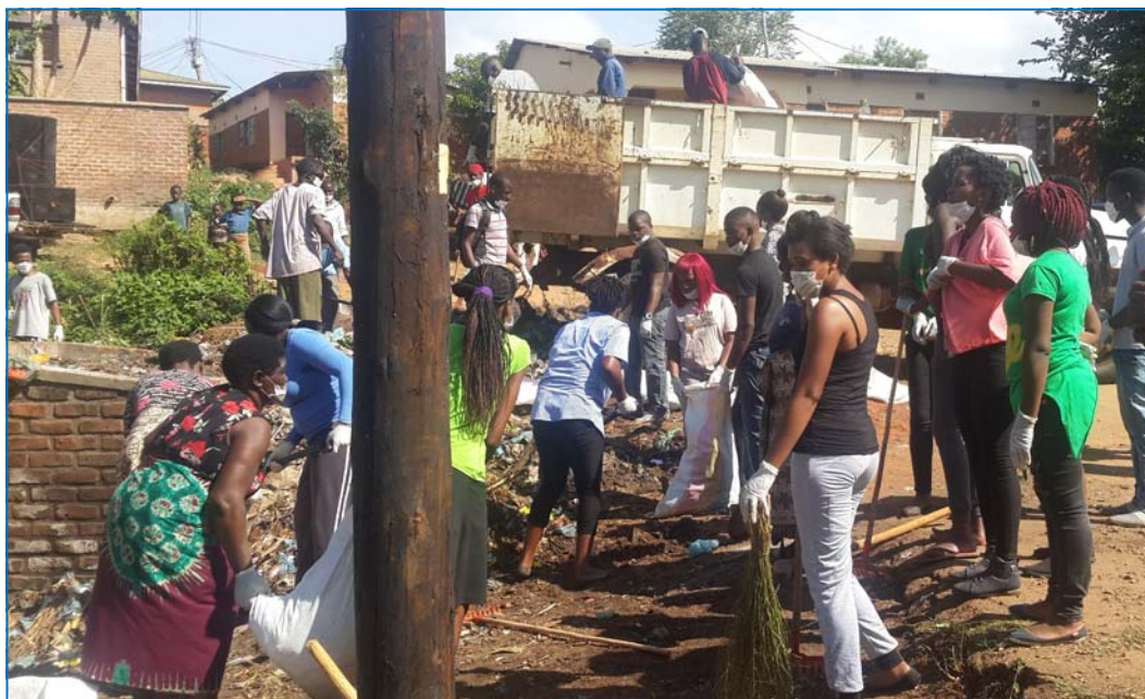
Students join hands with the Chikanda community in cleaning the environment