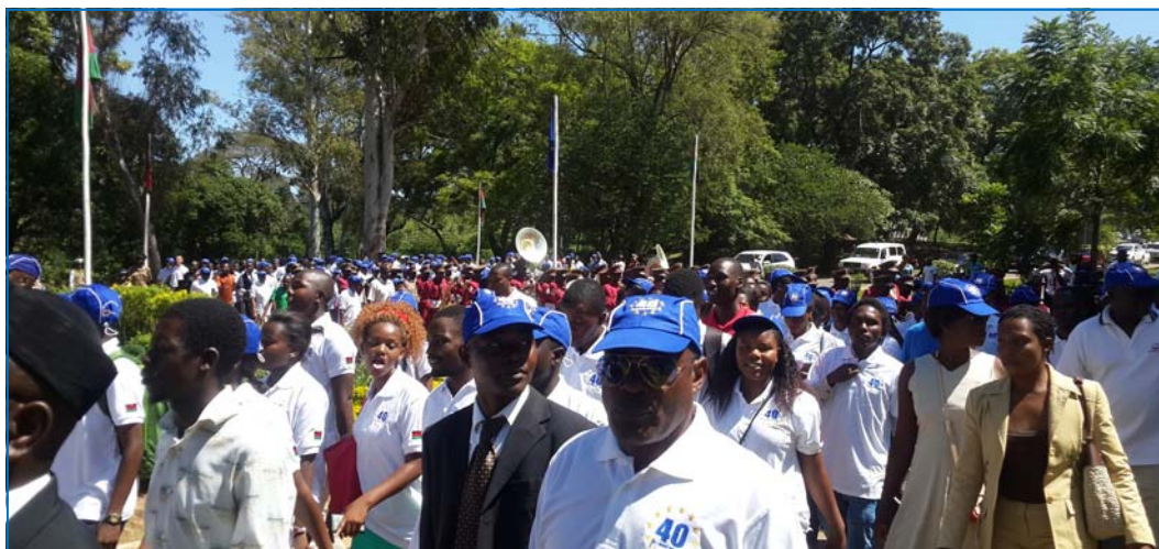
A section of participants in the big walk