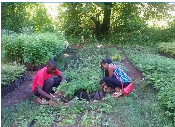
Students collecting tree seedlings

At this tree planting event, about 1,000 seedlings were planted. These seedlings were made available to the students from LEAD-SEA through Professor Sosten