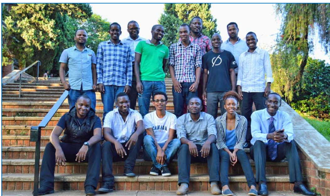
NHIS2 Workshop participants pose for a group picture

The hope is to develop capacity for DHIS2 software customization and app development, to address local and regional software development needs, in support of program monitoring and evaluation. There are plans to continue with such workshops in the future.