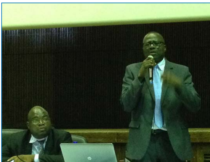
The Pro-VC explains why accreditation is good for the University of Malawi

The meeting ended inconclusively, as the majority of staff at the gathering conveyed Chancellor College's wish not to be accredited by NCHE.