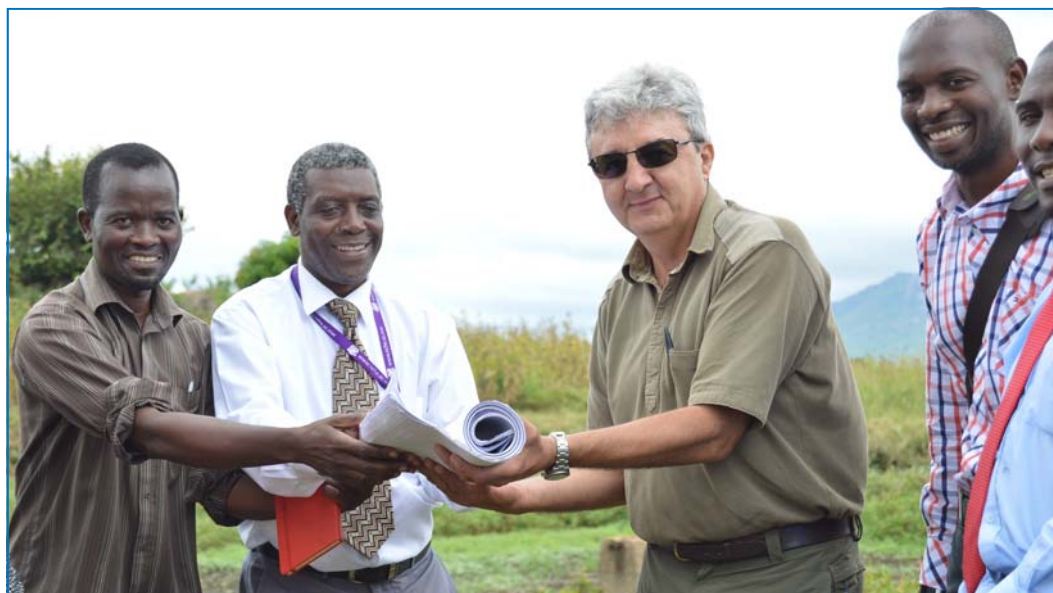
Chancellor College officials (left) handing over construction plans to the contractor.

The sites are already being cleared for construction.