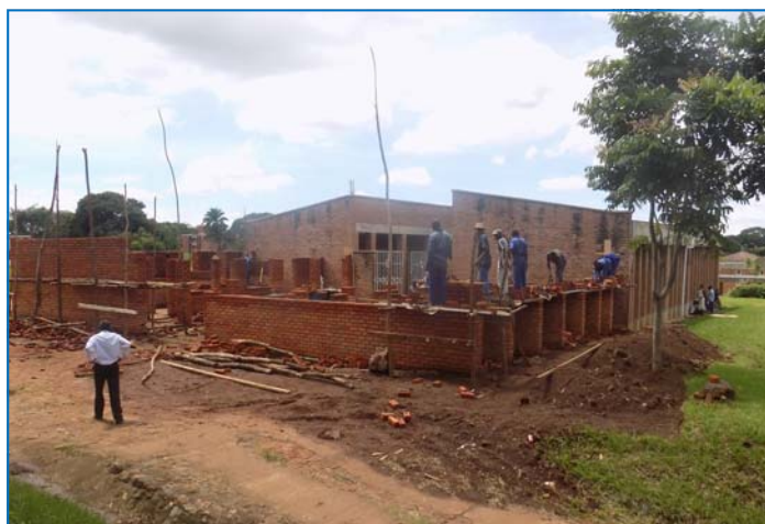
The building under construction

Construction is due to be completed in August 2016.