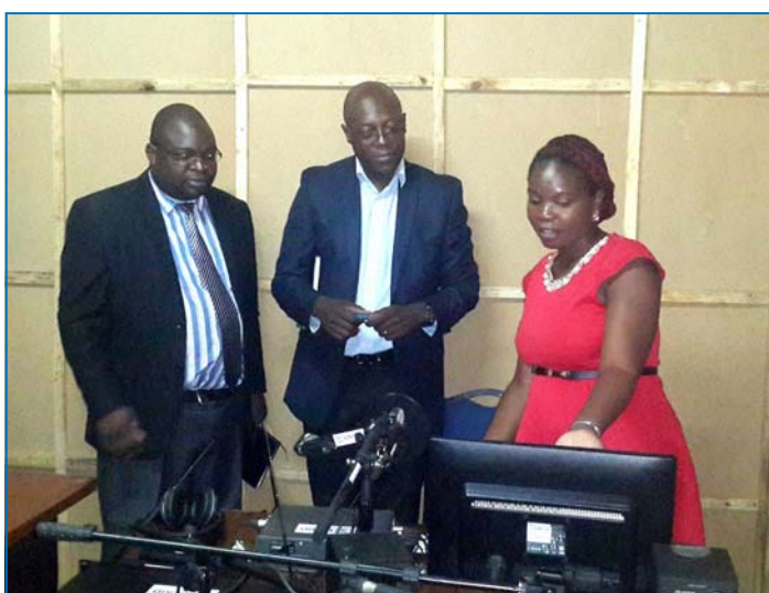
An employee at Chanco Radio displays how the equipment operates

SSDI also supports Chancellor College in other ways. They provide an internship program in Health Communication for BACOM students. They also support guest lecturers in different fields willing to teach in the programme. The project has also provided training in leadership and strategic health communication for lecturers at Chancellor College.