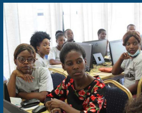
One of the classes in session