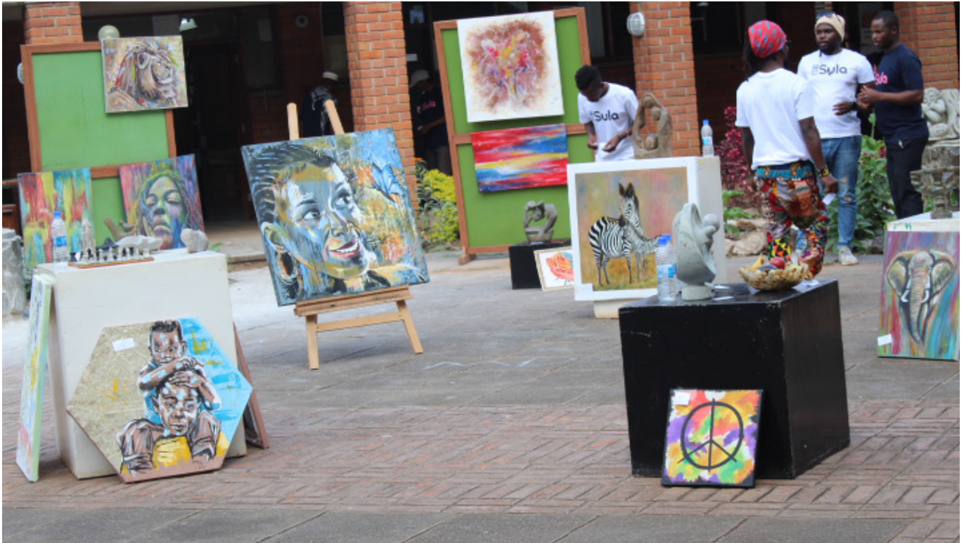
Artists exhibit their pieces