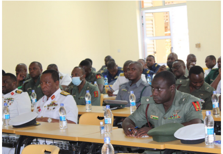
Nigerian military students during the talk