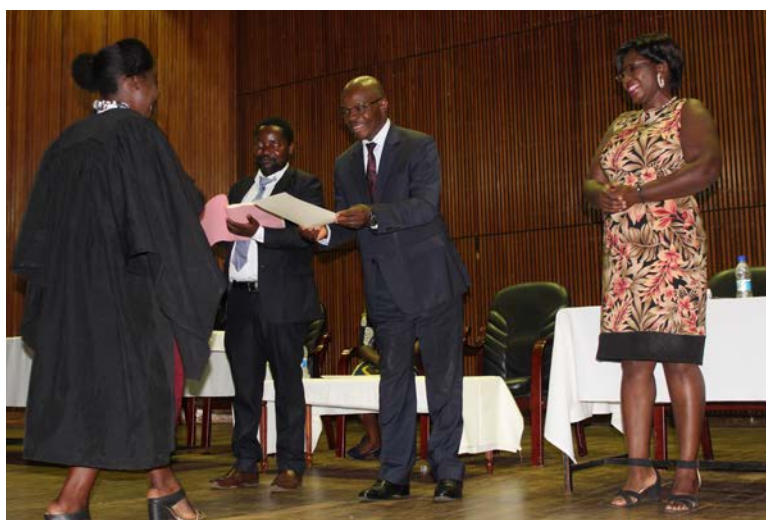
The Dean of the School of Education presents a certificate to one of the graduands

60 students graduated with certificates in Principles and Practices of Education for Science Teachers, Project Planning and Management, Inclusive Education, Guidance and Counselling and Leadership and Management for Education Practitioners.