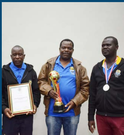
Swimming in success: a display of UNIMA's sporting prowess

The University of Malawi Staff Sports Association (UMSSA) volleyball team has retained the Volleyball Trophy after emerging champions in the second Intersvarsity games that took place at the