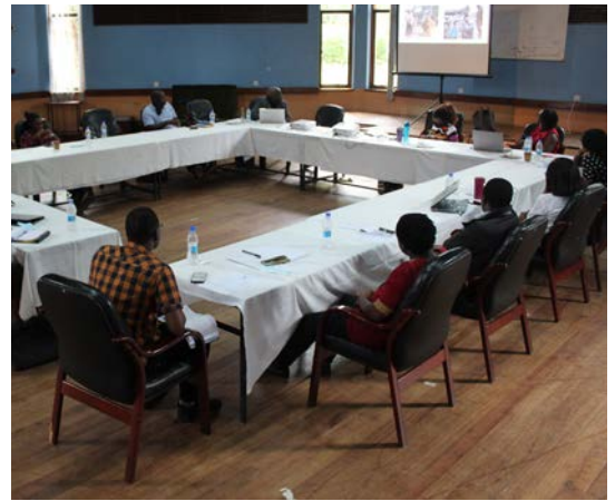
Participants at the writing workshop