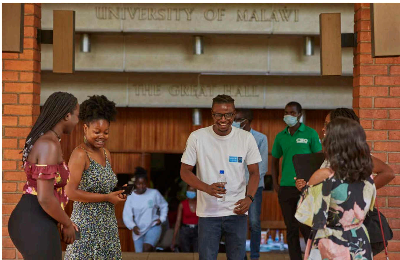
Students proud to be enrolled at the best university in the land