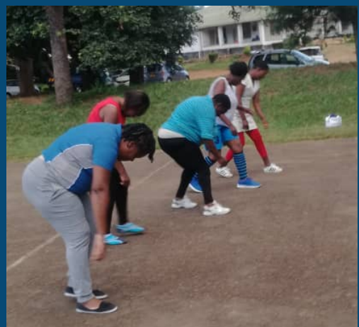
Ladies participating in aerobics

The aerobics sessions were organised upon realizing that there are people who desire to be active, after sitting at their desks for long periods of time. People do not have to be sports professionals to participate. Currently, UMSSA members with better experience in aerobics train their colleagues but the association is liaising with the Sports Officer to bring into the picture a professional trainer. These sessions are usually held at the Sports Complex netball court, but there are plans to move it to the gym, to ensure that there is some privacy and fewer distractions. The only problem is that the gym is currently being used as a classroom by the university.