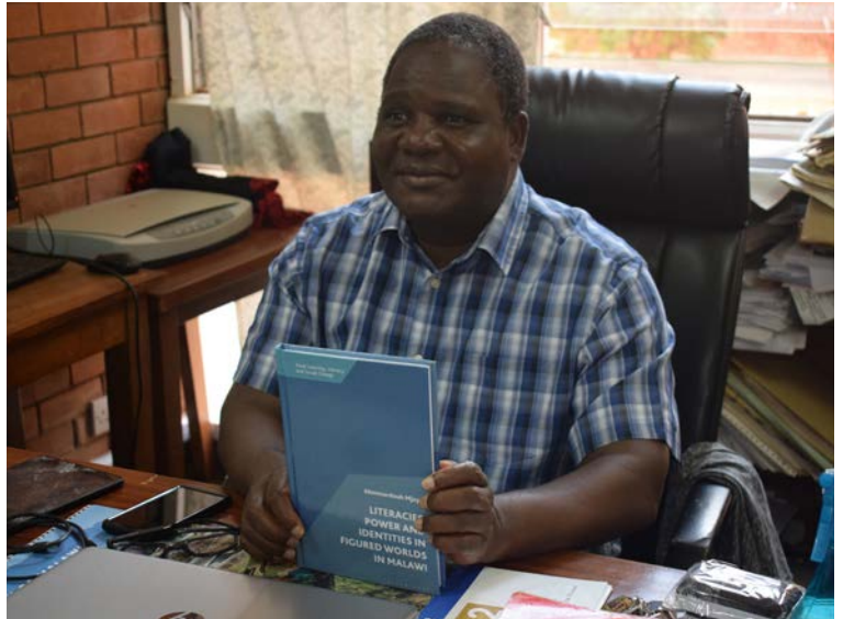
The proud author displays his book

"I did not only focus on literacy from a classroom perspectives, but rather how communities regard literacy. Some people attend adult literacy classes just