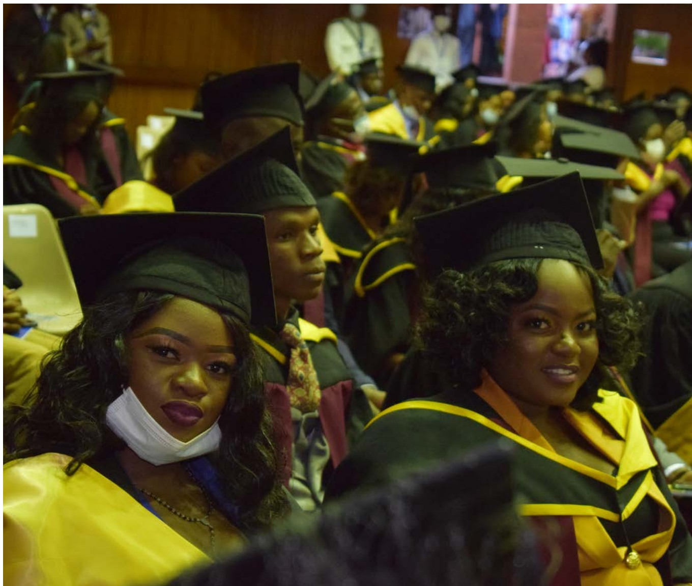
Smiling graduands in the Great Hall