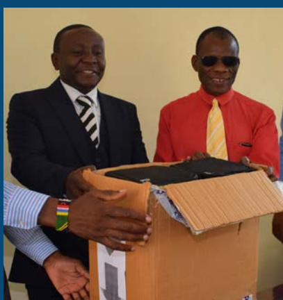
The Vice Chancellor receives the devices on behalf of the University

On 25th April, 2022, the University of Malawi Special Needs Section received a donation of 20 assistive devices for visually impaired students. The devices, which are called Orbit Readers, have been donated by the Kilimanjaro Blind