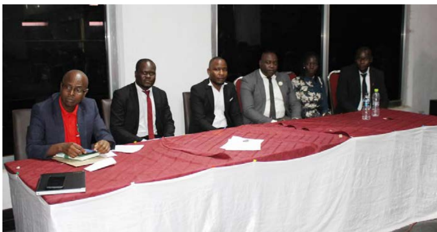
New MALA Executive Committee