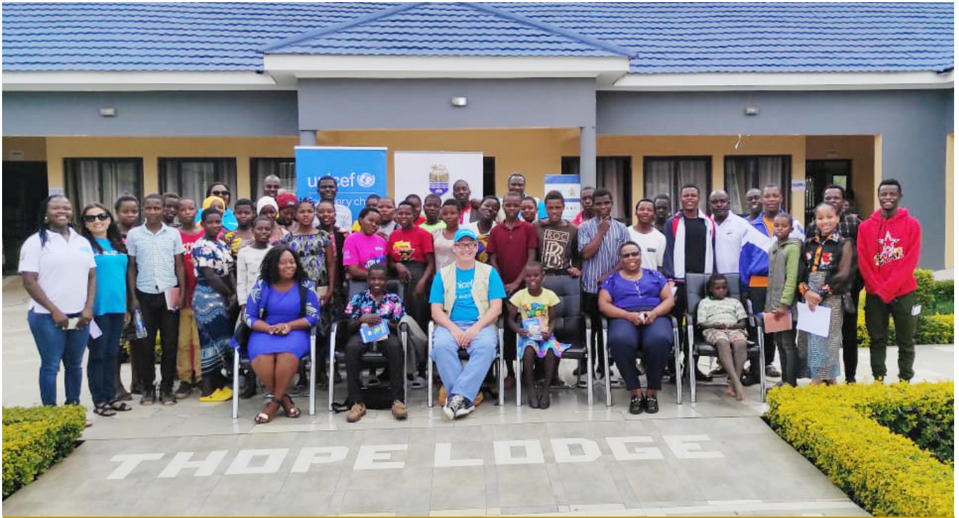
Participants at the validation workshop