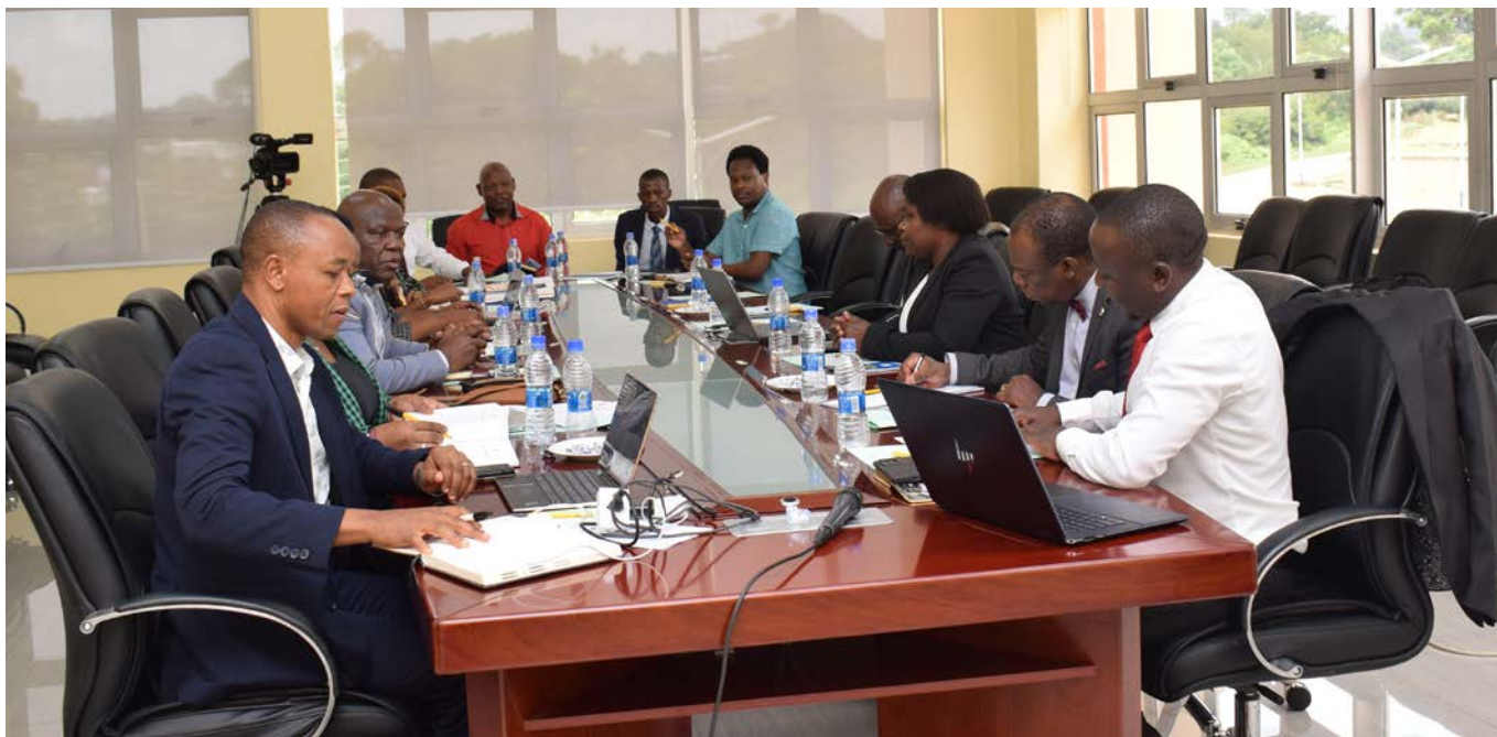
UNIMA and MZUMBE representatives discuss areas of collaboration