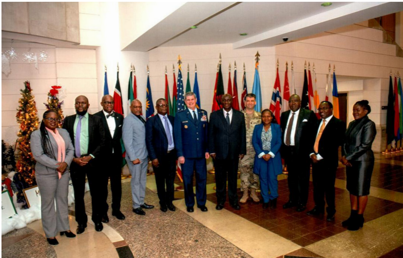
A photo opportunity with military personnel during the trip