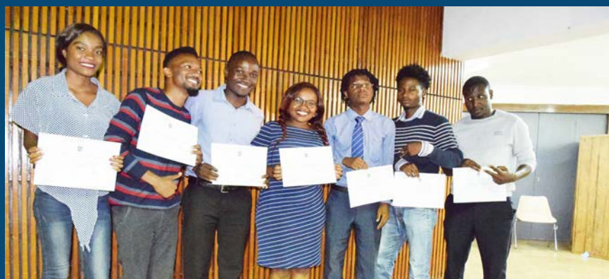
Some previous Dean's listers

For a long time, UNIMA has striven to recognize students who perform well, by publicly announcing them on the Dean's List, and awarding them certificates as testament to the same.