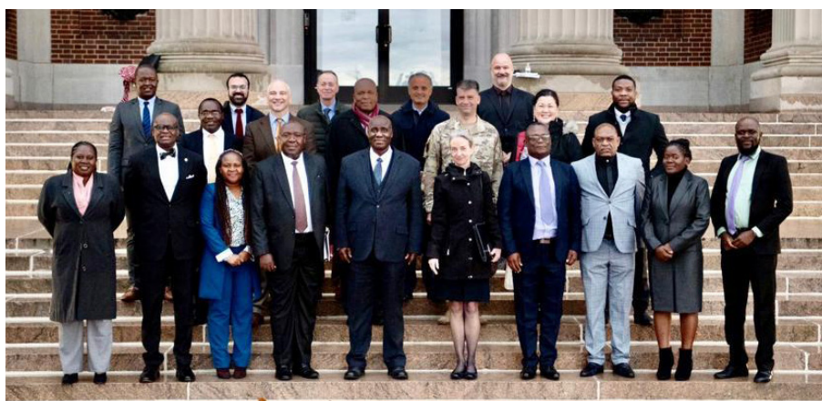
The UNIMA team poses for a picture with other delegates