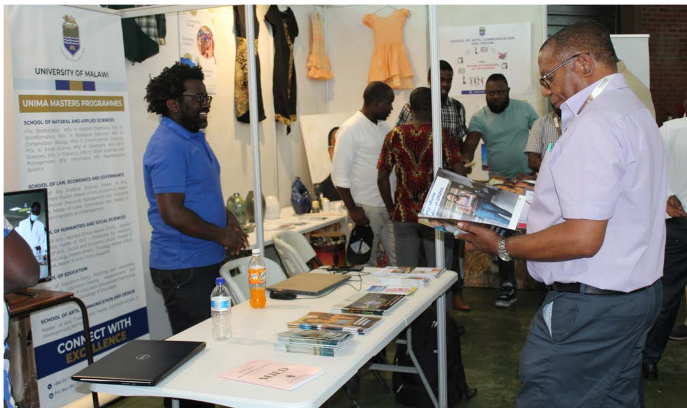
Executive Dean of Humanities and Social Sciences showcasing UNIMA's programmes