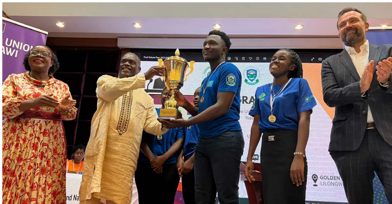
Celebration! The UNIMA team receives their trophy