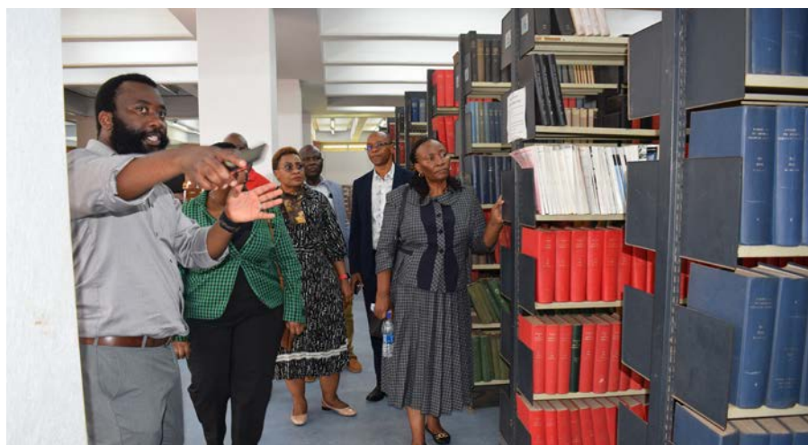
The Mzumbe team on a tour of UNIMA's library

UNIMA has MOUs with several institutions within the region.