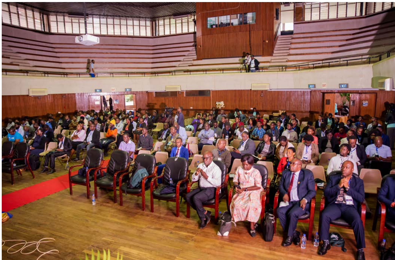
Participants at the conference