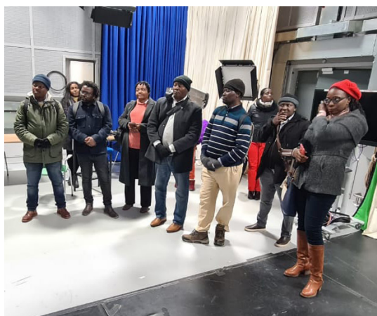
UNIMA staff touring the facilities at Bath Spa

The University of Malawi is committed to strengthening ties with other universities, as a way of improving its internationalization objective. One of the most recent efforts in this direction was a trip that staff from UNIMA undertook to Bath Spa University in the United Kingdom, from 21st January to 5th February, 2023.