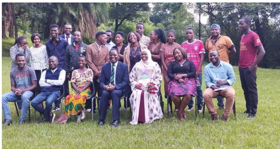
Staff of Chanco Community radio showing their support