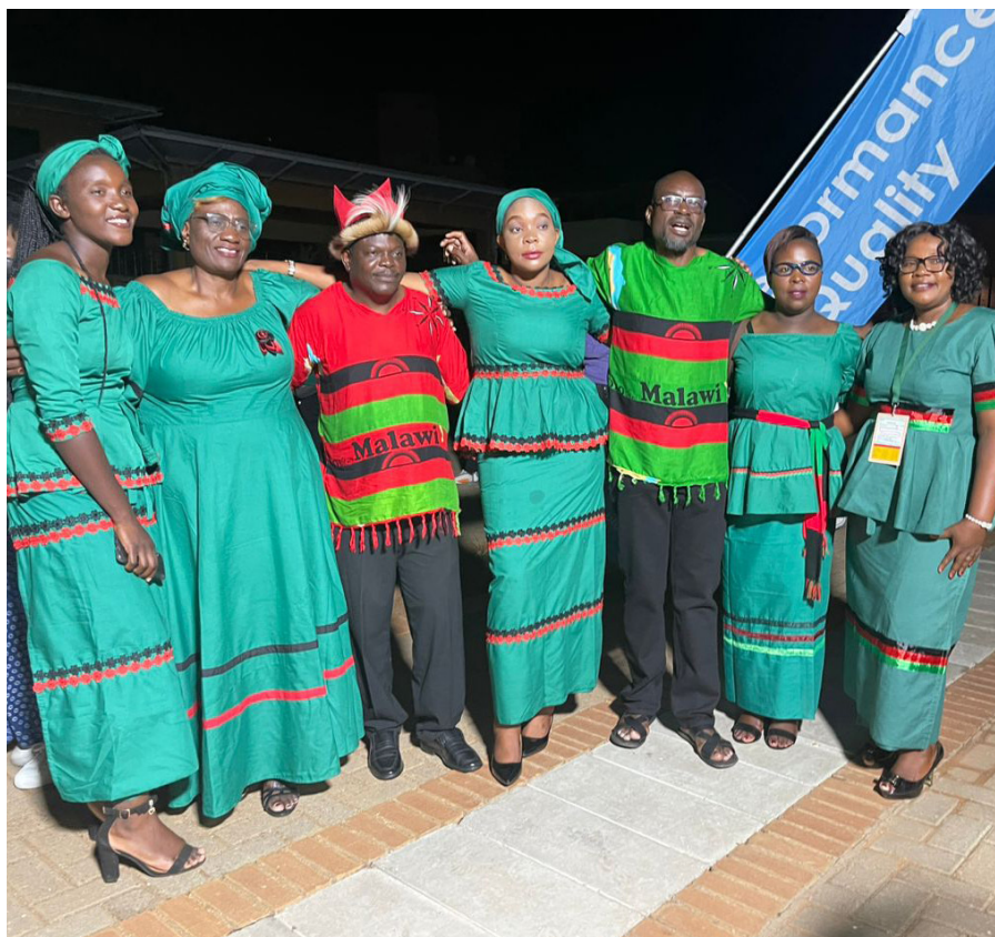
Unima athletes at the Cultural Night

During the cultural night, which is normally held on the Thursday of the week of the games, the PUSSAM team dressed in traditional wear bearing the Malawian flag colours. They also used the opportunity to share Malawian foodstuffs with their fellow sportsmen from other countries, and also