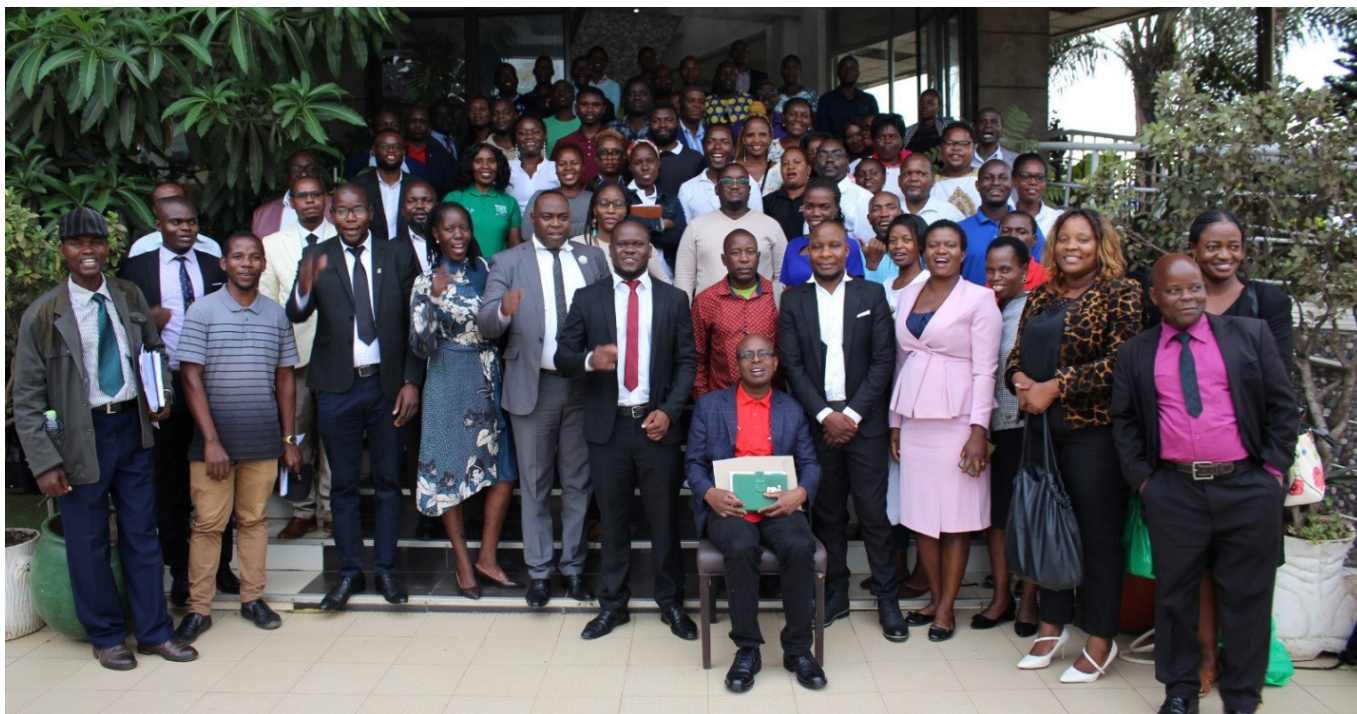
Librarians at the MALA indaba