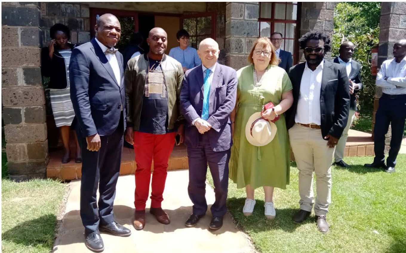
UNIMA representatives at the meeting