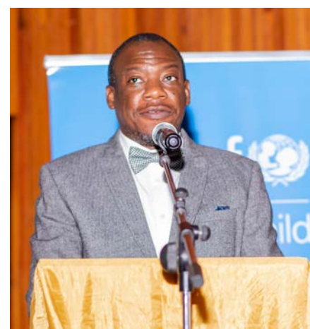
UNIMA Deputy Vice Chancellor making his speech

The conference was mainly funded by UNICEF. FDH Bank also funded awards that were given to the best oral and poster presentations.