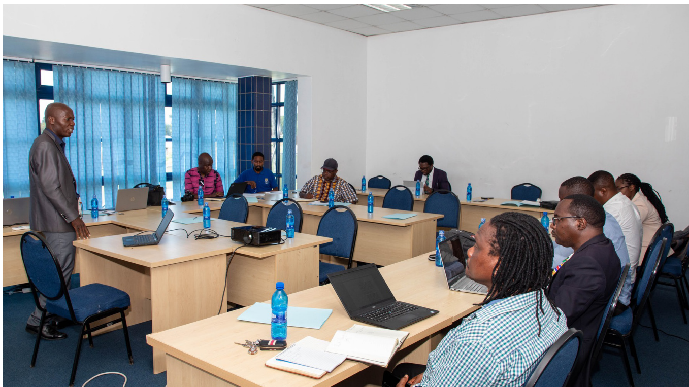
Stakeholders discussing ways of improving the new programme.