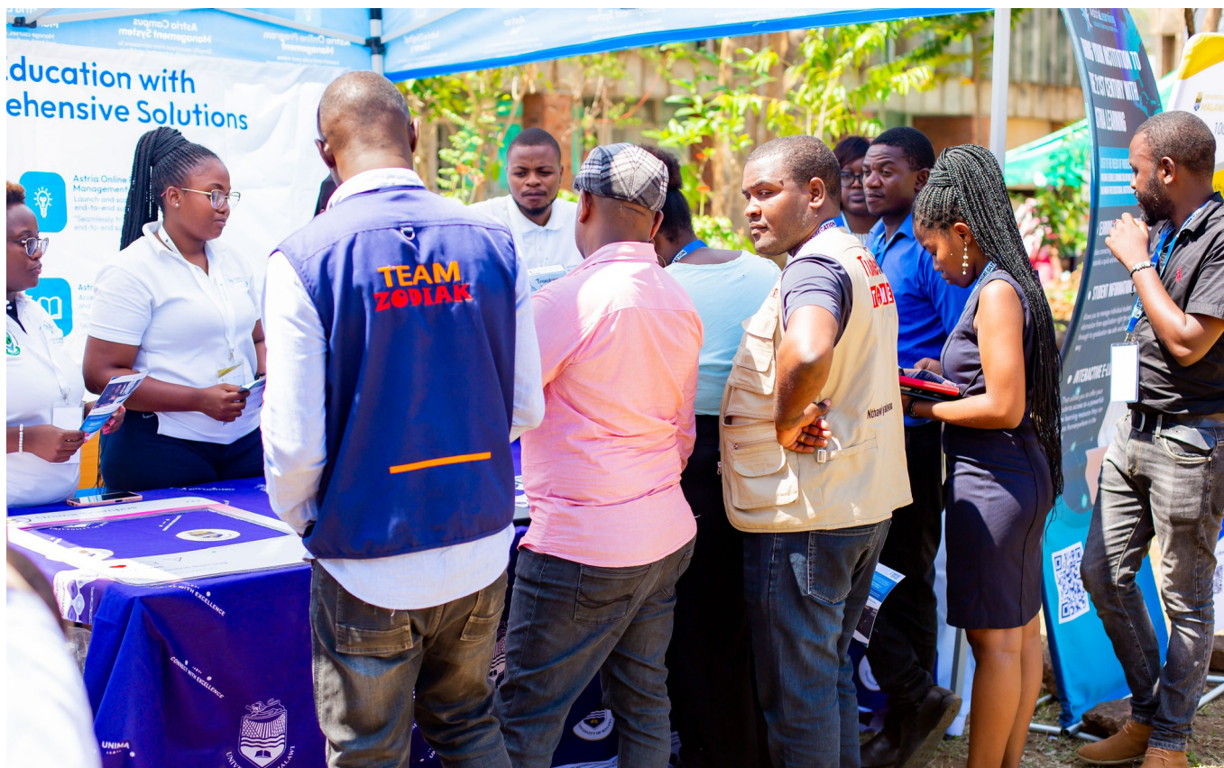
Members of the Press appreciate some of UNIMA's innovations.