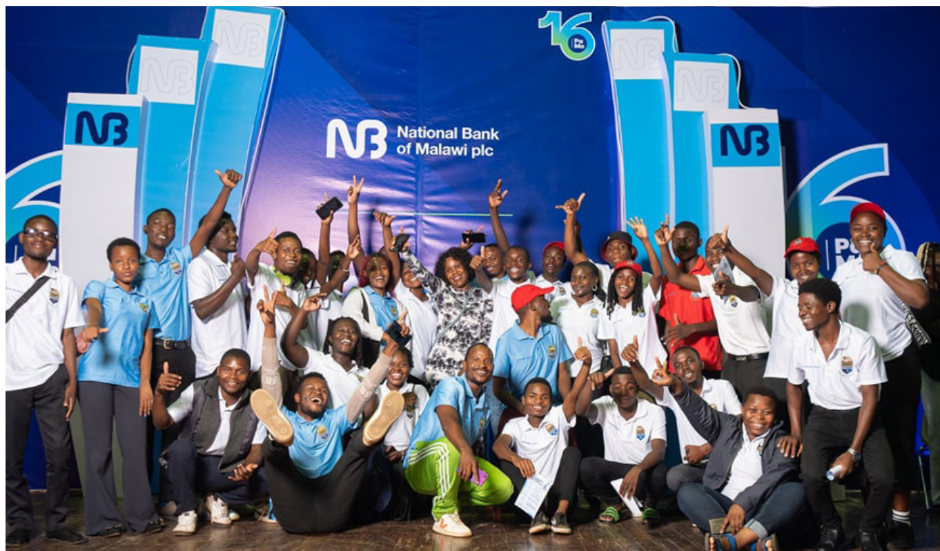
UNIMA students celebrate the announcement of the awards initiative.