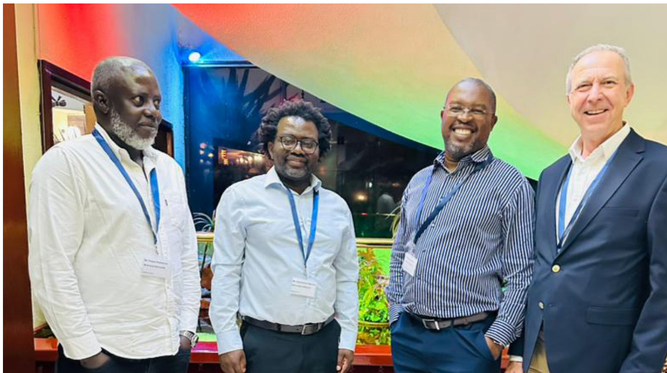
Attendees during a moment of relaxation at the meeting.