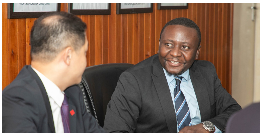
The two leaders engaged in talks.

to spend a semester at UNIMA and vice versa. They also suggested that UNIMA students could benefit from opportunities to work in Chinese institutions, gaining insight into different governance systems. Additionally, the delegation mentioned that, as China is a leading producer of technological gadgets, partnerships with Chinese companies could benefit UNIMA. These agreements could enable the supply of essential devices, such as computers and phones, to support students' academic needs. The ceremony concluded with the presentation of UNIMA branded gifts to the Chinese officials, who in turn presented gifts to the UNIMA team.