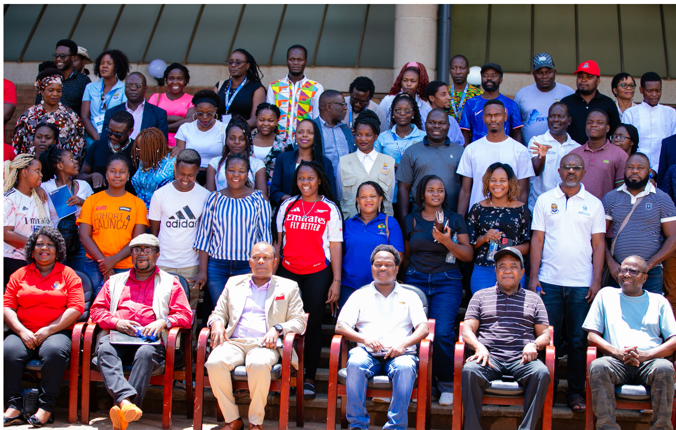
Attendees of the UNIMA Alumni Association meeting.