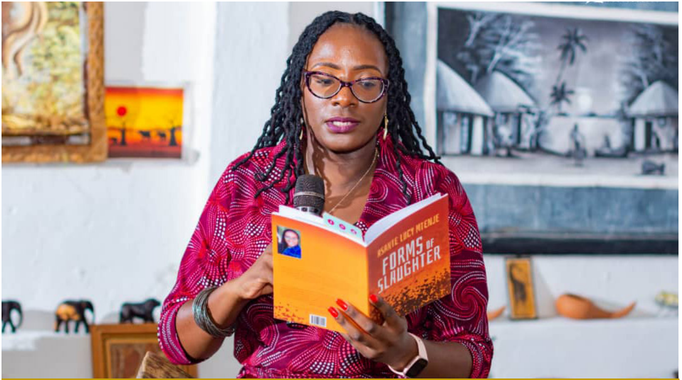
The poet reads from her publication.