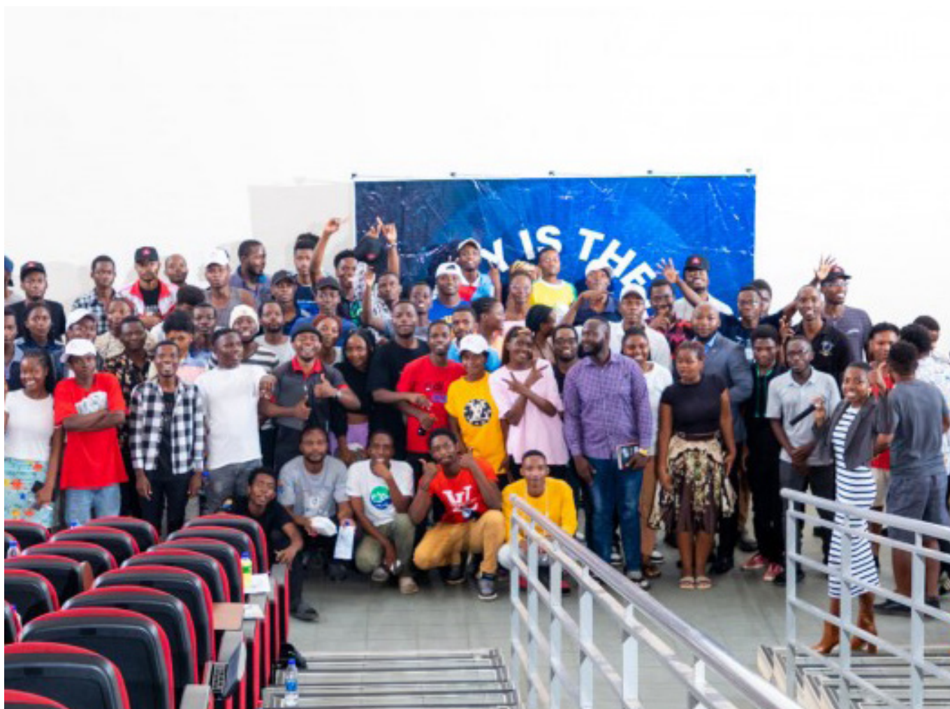
Students pose for a picture at the recruitment drive.