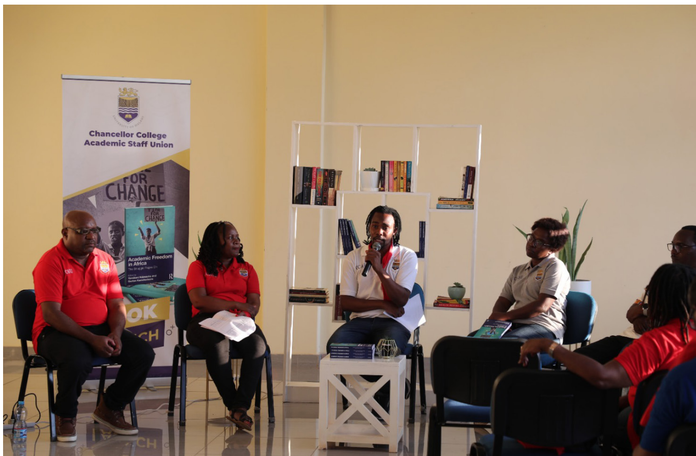
A panel discussion on academic freedom, during the launch.