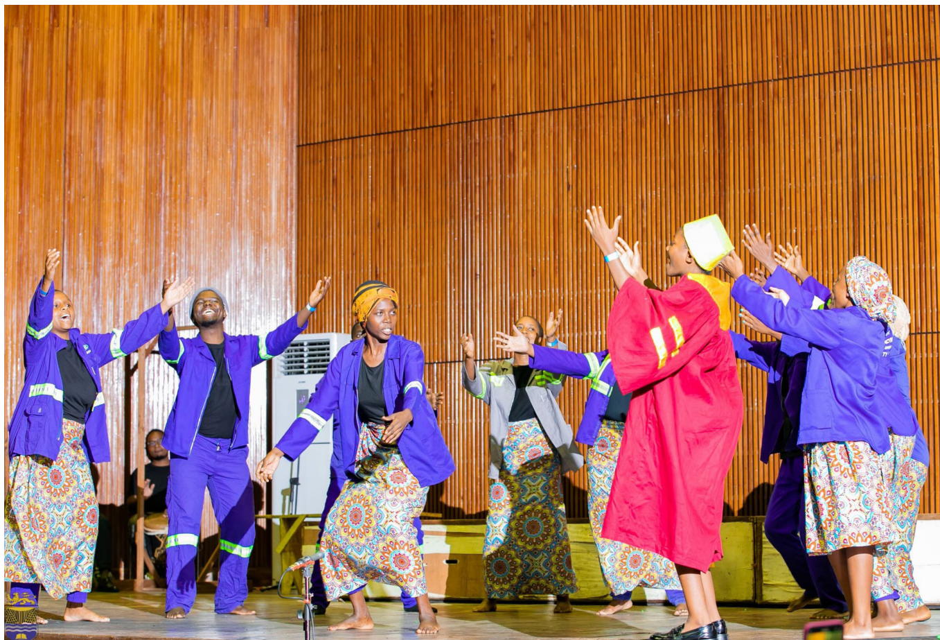
A theatre performance in the Great Hall.