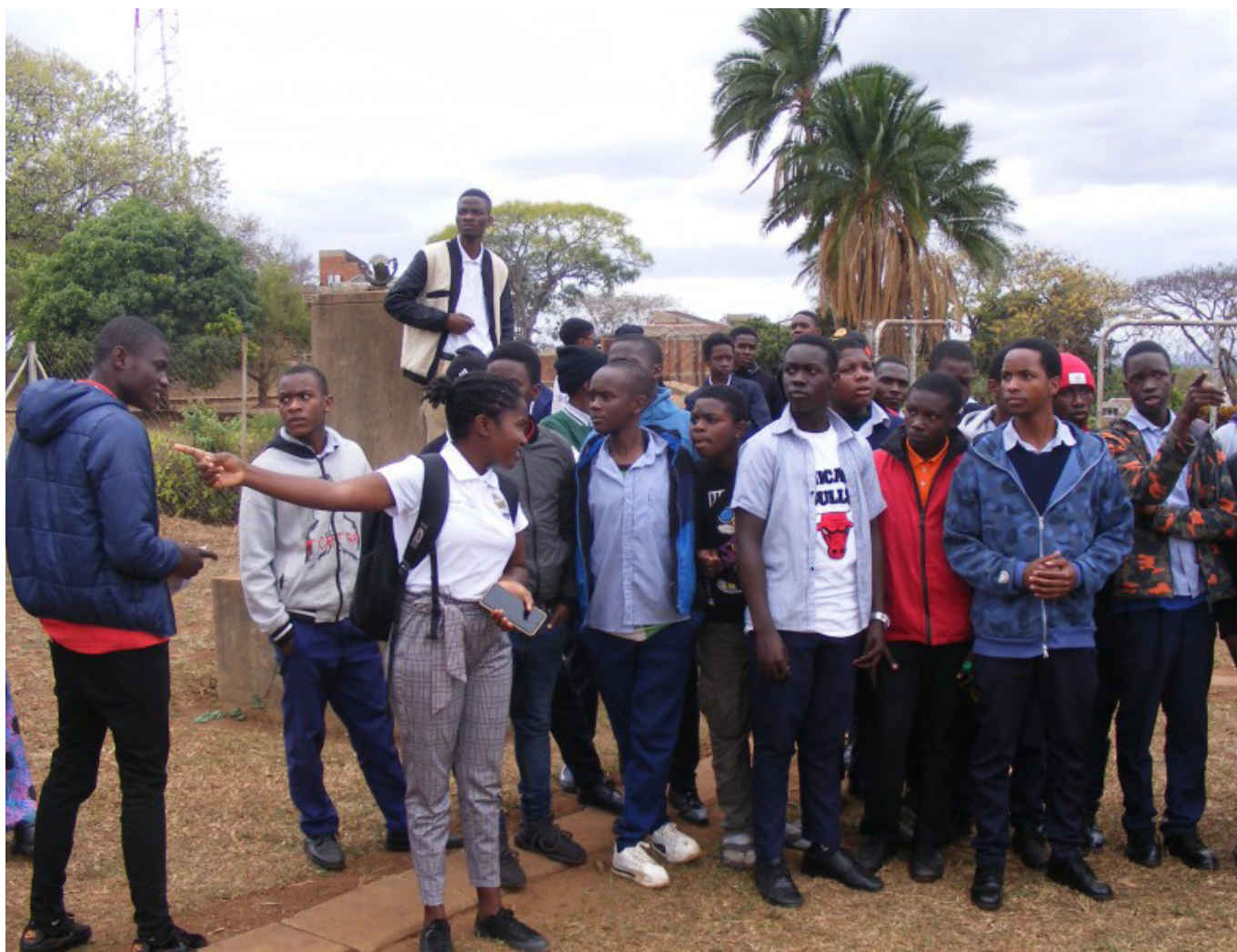
Secondary school students on a tour of UNIMA.