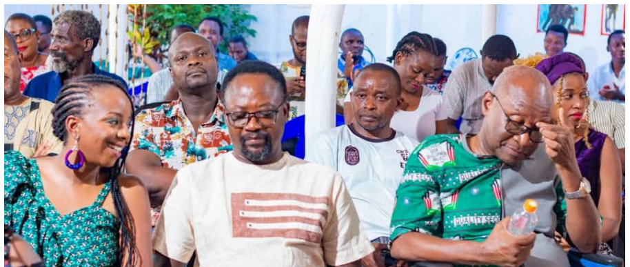
Academics, writers, friends and family attended the launch.

Forms of Slaughter and other poems has been published by Pan African Publishers, and is currently available in most of the major bookstores in the country.