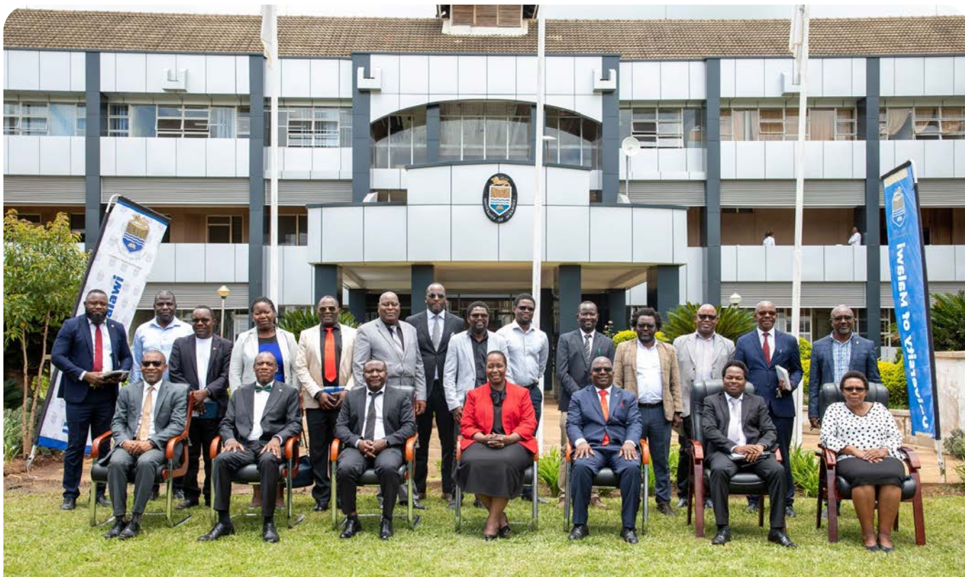
The Minister of Higher Education poses with UNIMA staff at the University Office.