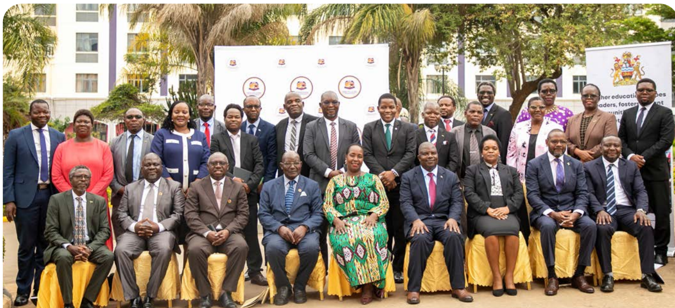
Leaders of the Higher Education sector at the NCHE university admission announcement ceremony.