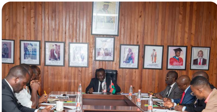
The Vice-Chancellor hosts delegates from Centenary Bank at the University Office.

The Vice-Chancellor expressed his excitement and gratitude for the visit. He emphasized the vital role of partnerships in advancing UNIMA's strategic goals, particularly in improving operational efficiency and enhancing service delivery. "We appreciate the visit as it is a crucial step in fostering strong and beneficial