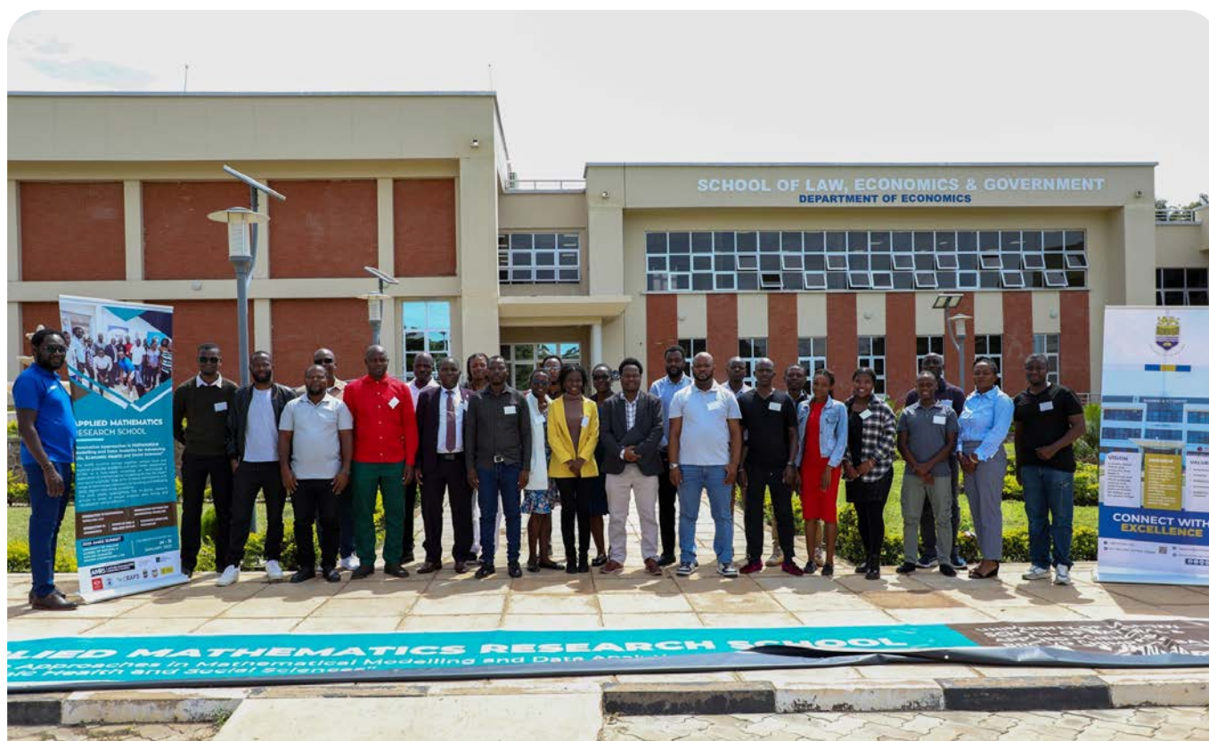
Participants at the Research School.