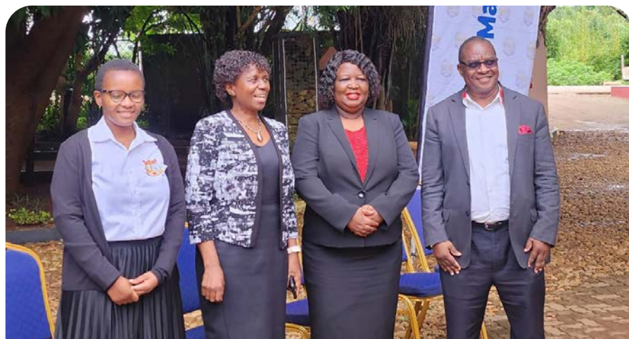
Part of the organising team.