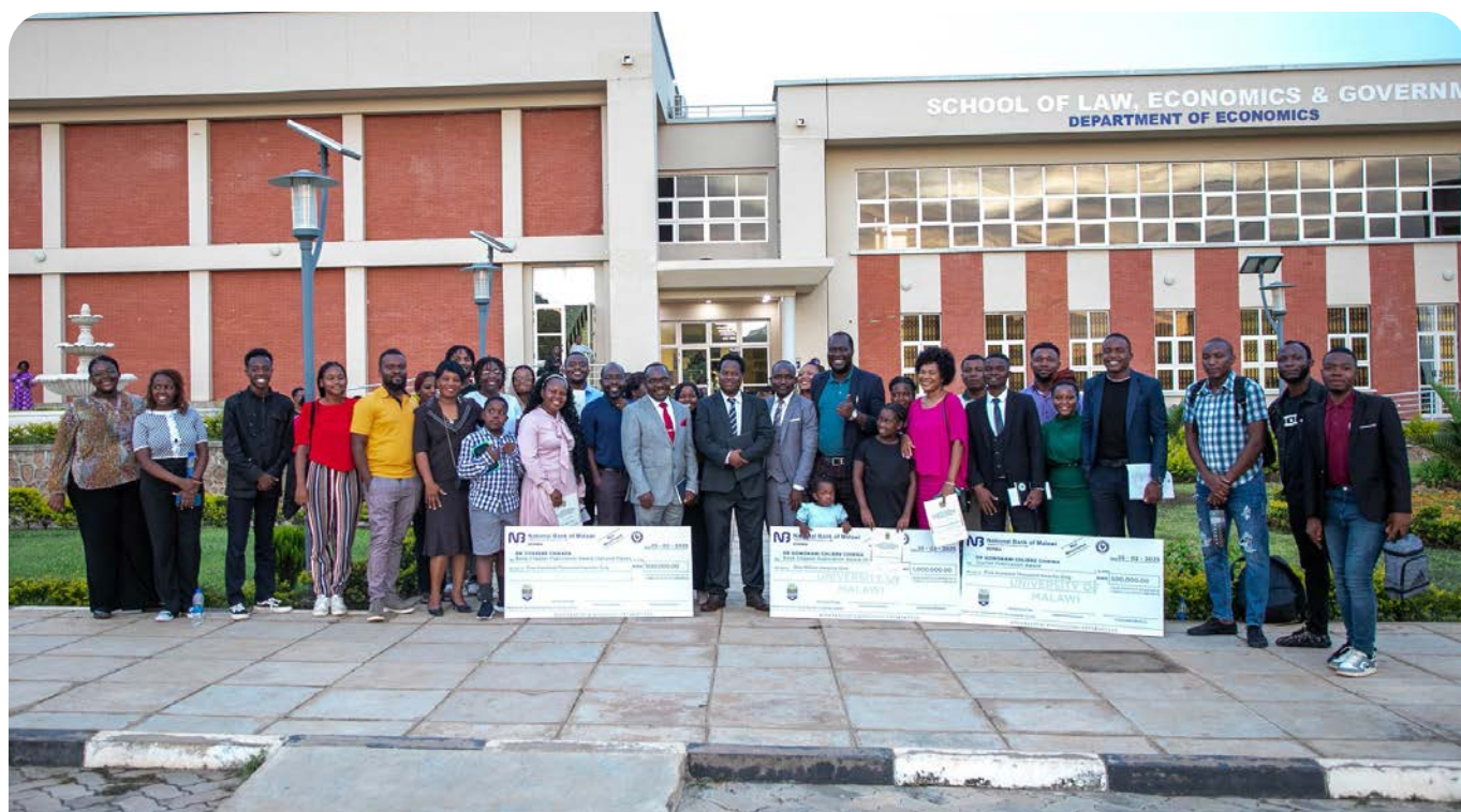
Awardees pose for a picture with family and friends.