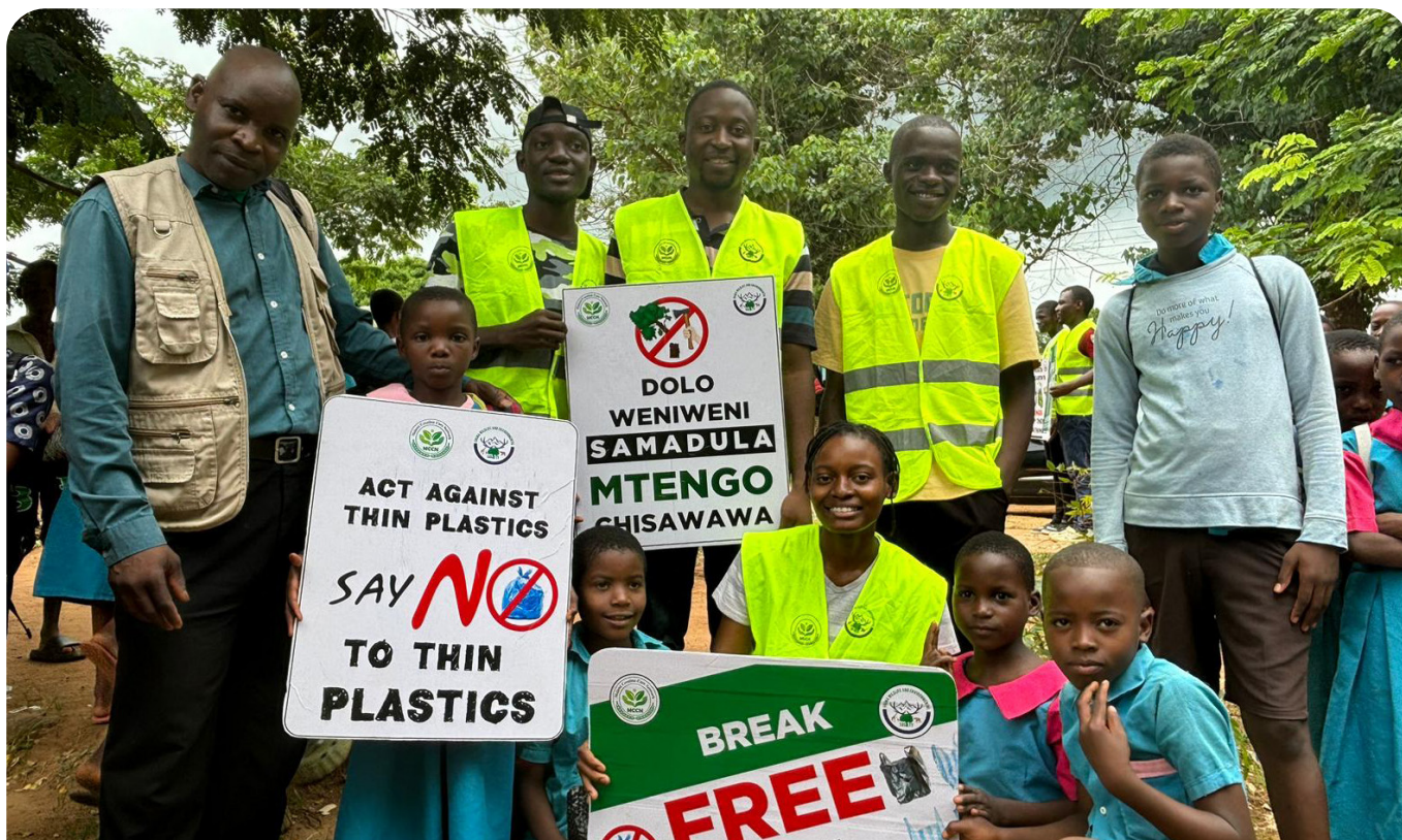
Proud members of UNIMAWES pose with primary school students.