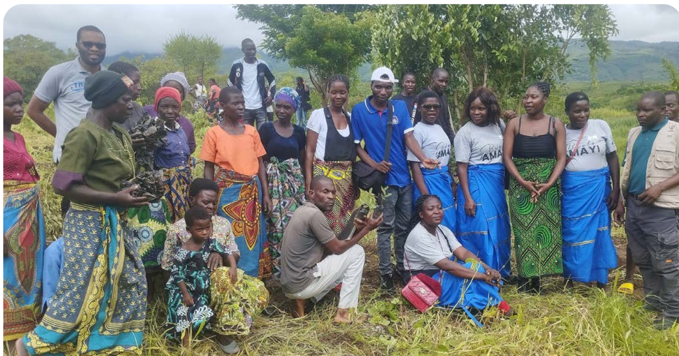
The Bwalo la Amayi Group takes a break during the tree planting exercise.