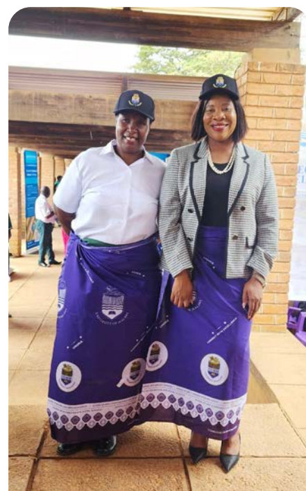
Minister of Higher Education and Minister of Basic and Secondary Education.

Through its participation, UNIMA continues to position itself as a leader in AI-driven education and digital transformation, reaffirming its role in national progress through research, innovation, and strategic partnerships.