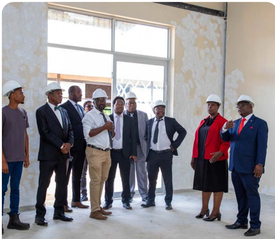
Appreciating one of the construction projects.

the university receives the necessary support to achieve its goals and operate smoothly.