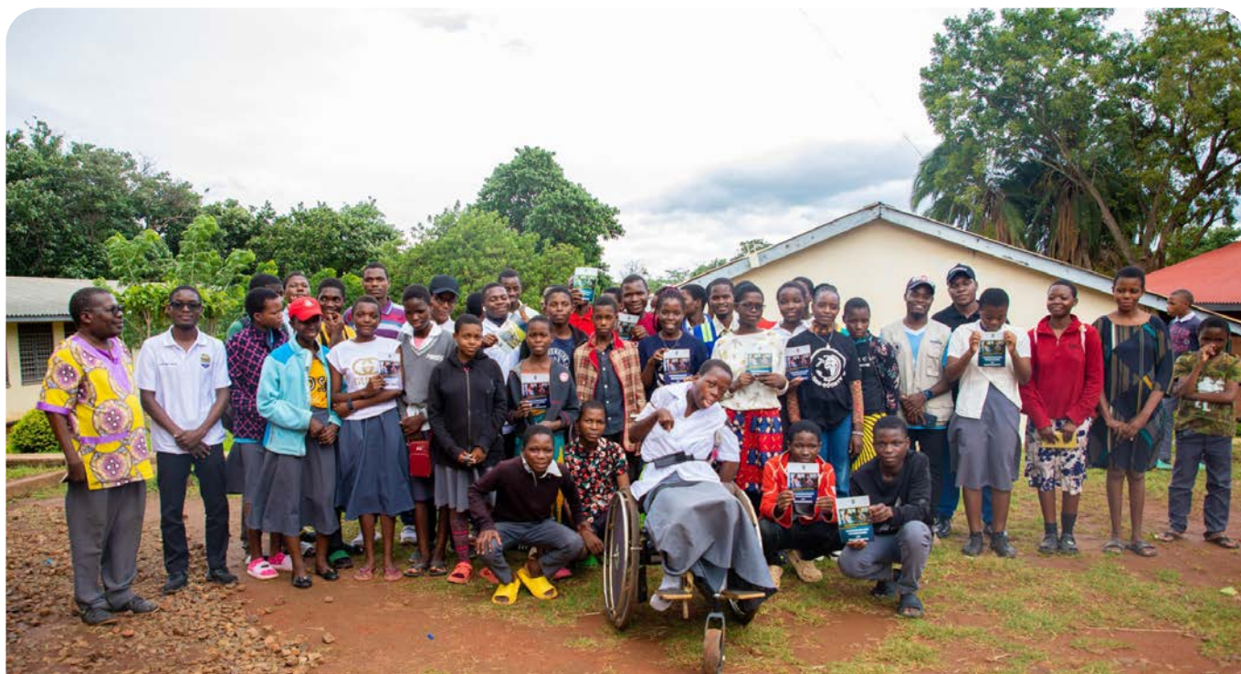
Masongola Secondary School students pose for a photo with UNIMA Geo-students.