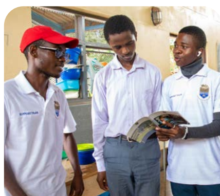
UNIMA Geo-students during the outreach session.