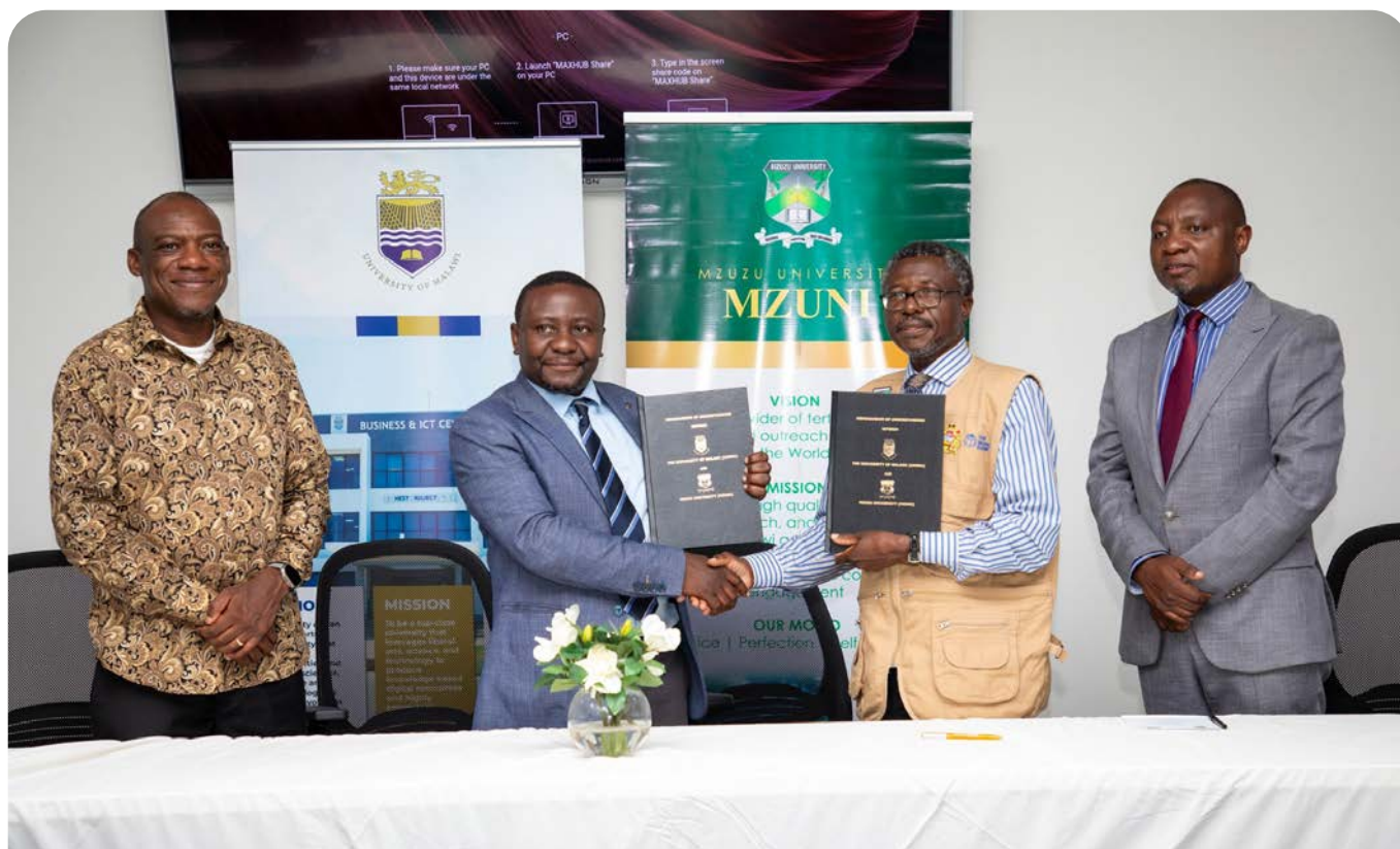
UNIMA and MZUNI Leadership formally signing the MoU.