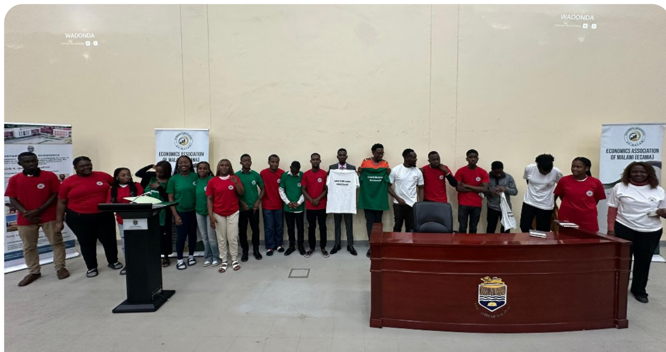
UNIMA Economics Society Students.