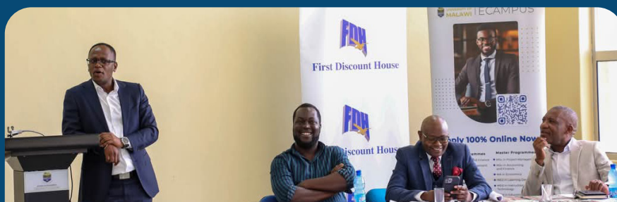
UNIMA and FDH staff engage during the meet-and-greet.