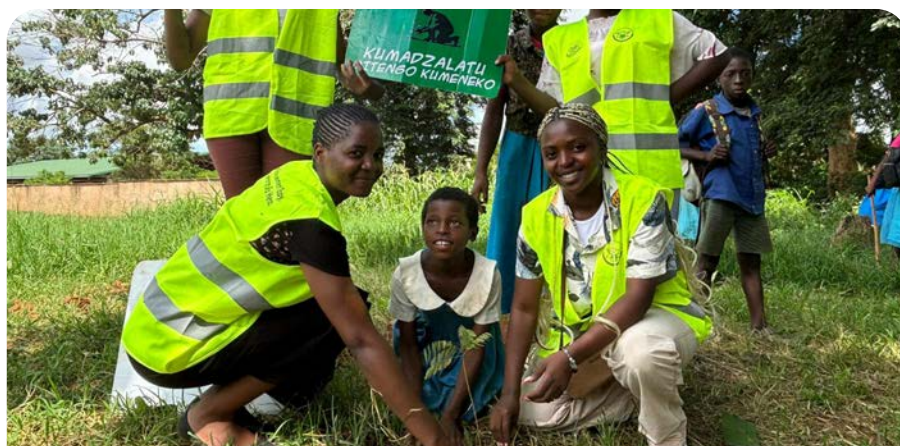
UNIMAWES: protecting the environment.

So far, the society has planted 500 trees across five primary schools in Zomba and plans to plant the remaining trees at various secondary schools.