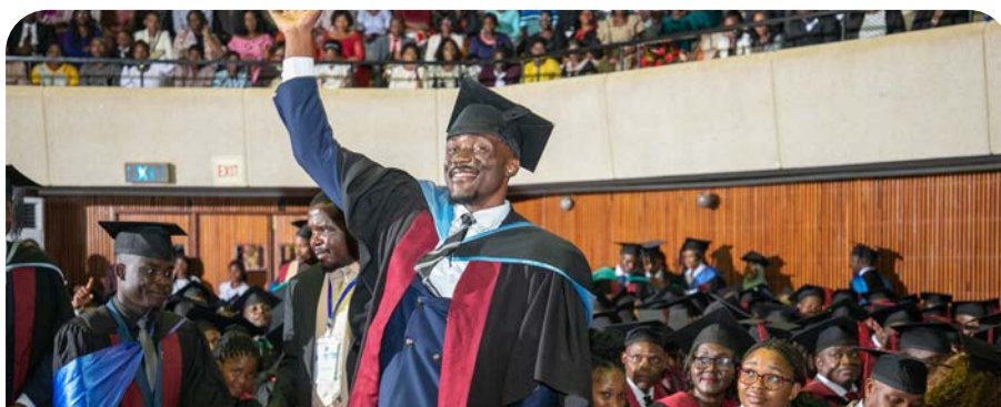
A graduand beams with pride as his name is read aloud during the ceremony.