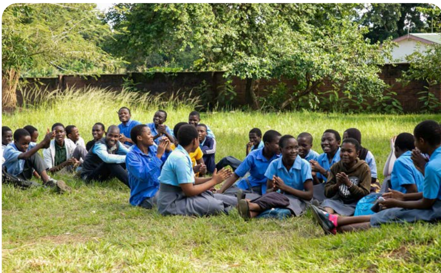
Mulunguzi Secondary School students at the function.

He also suggested that UNIMAWES visit them again to educate the students on how to repurpose waste into useful products as a sustainable waste management strategy.