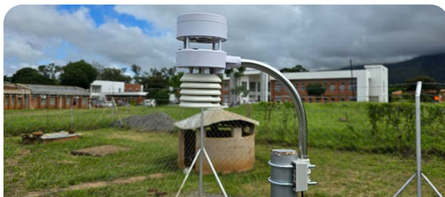
A close up of the Weather Station.

"When the project was being conceptualized back in 2018, we had no idea that cyclones would become such a pressing issue. But it has turned out to be one of the most relevant and appropriate projects considering the current situation," she said.