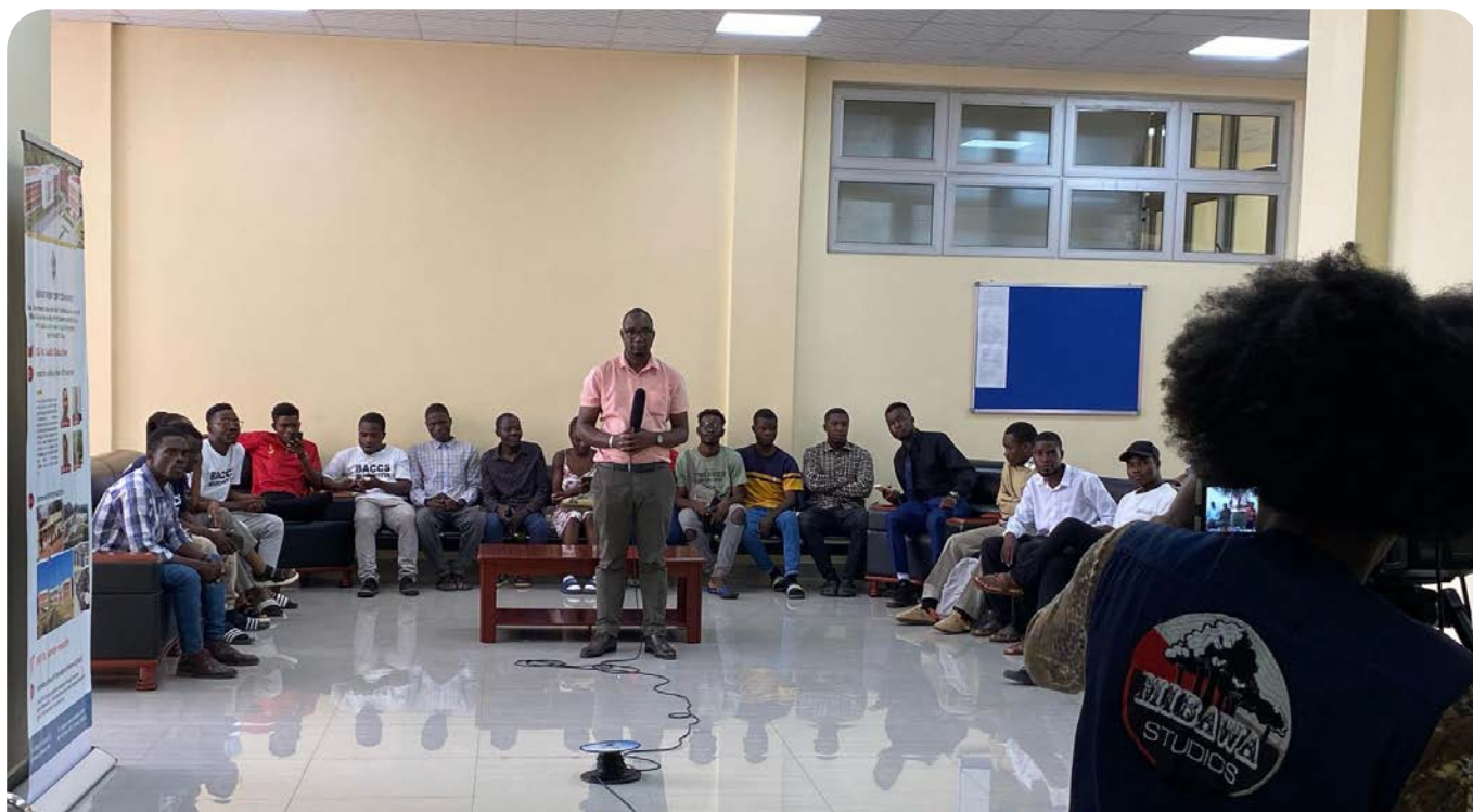
BACCS students engaging with Mibawa Television personnel.