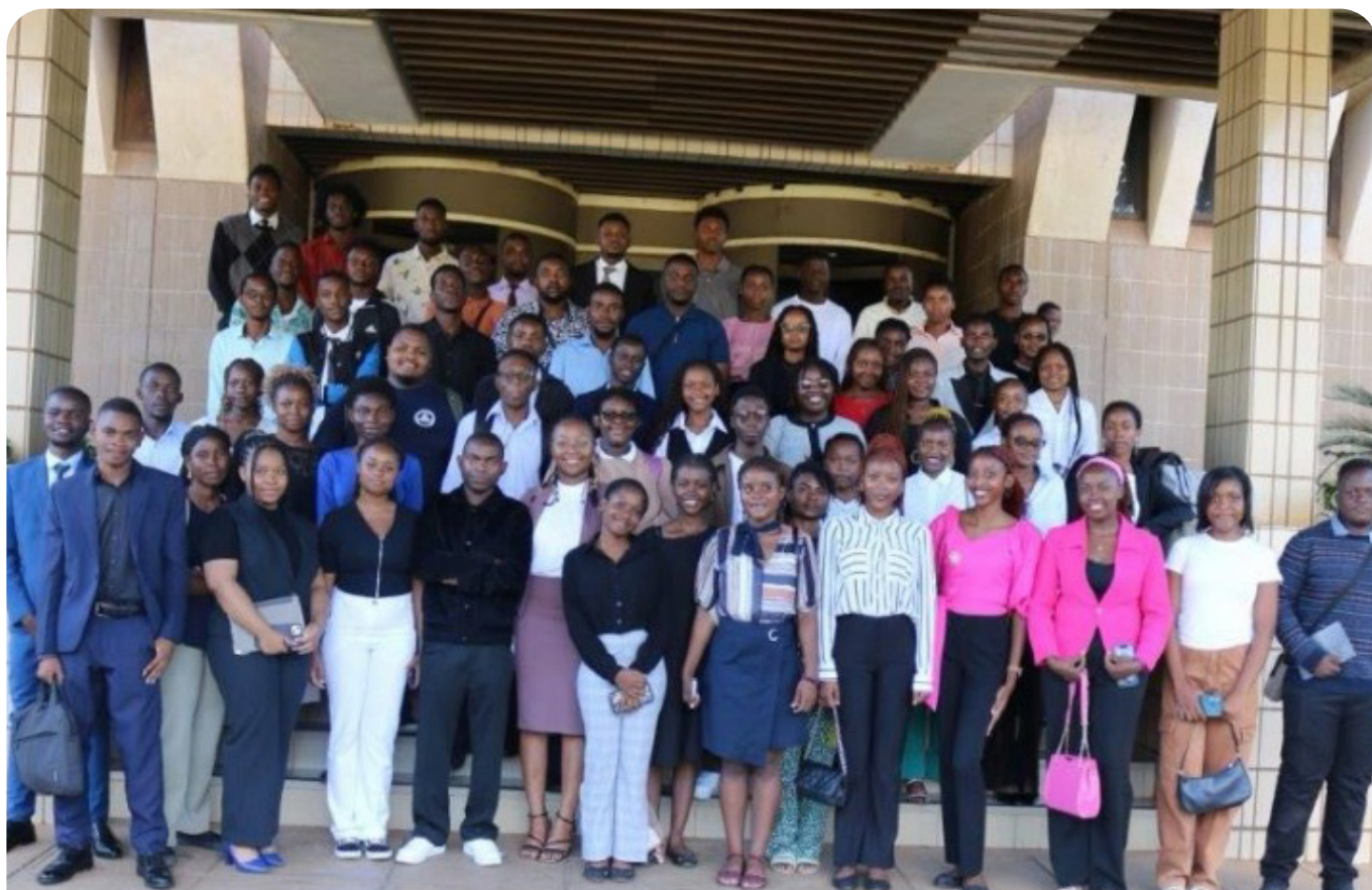
Members of the UNIMA Economics Society at the RBM offices in Lilongwe.