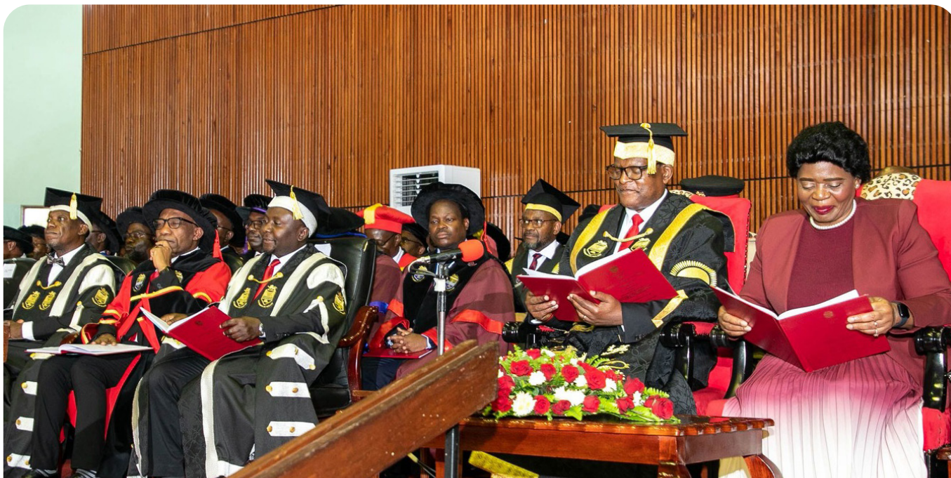
The President of the Republic of Malawi and Chancellor of UNIMA, Dr. Lazarus McCarthy Chakwera, presiding over the congregation.