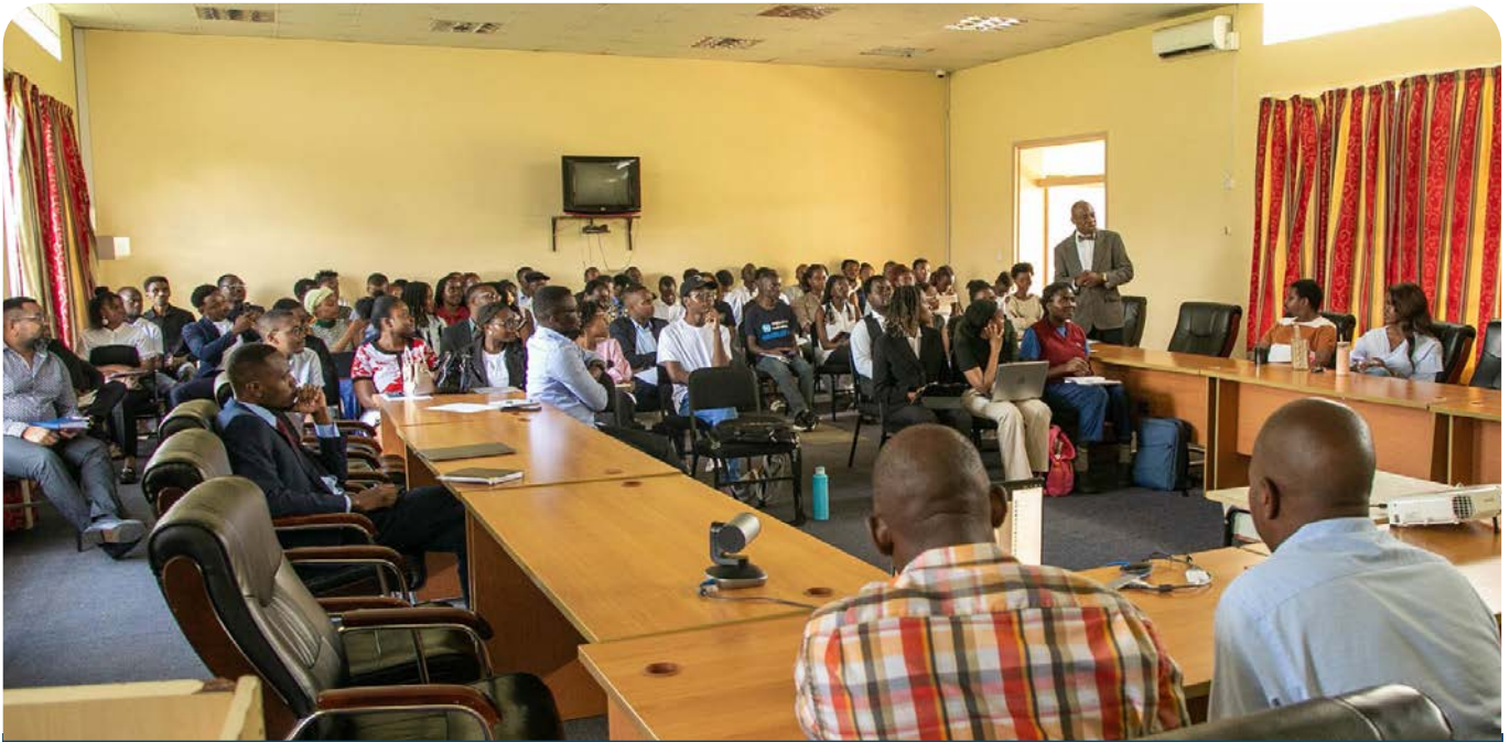
Young legal scholars engaged in discussion.