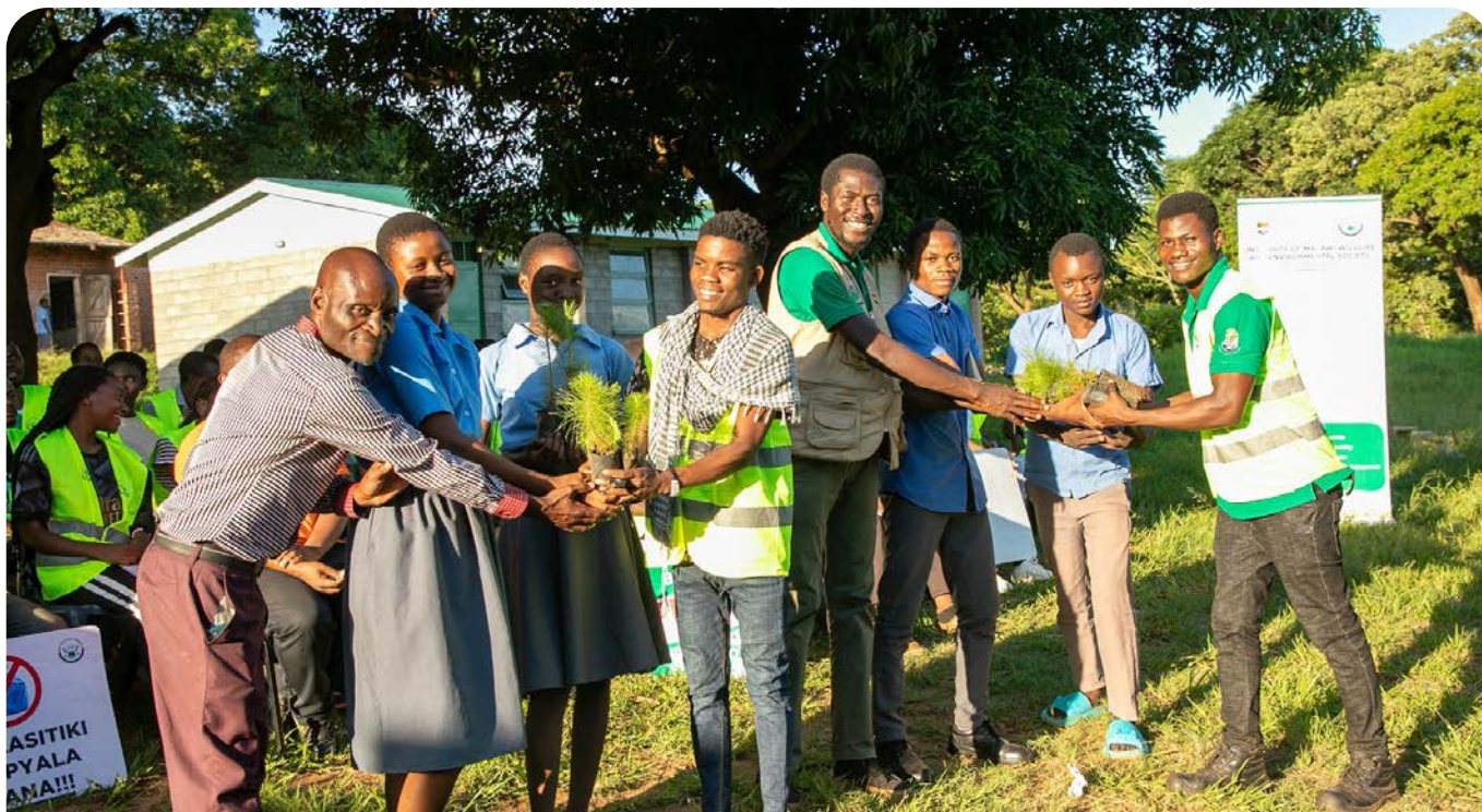
Handing over of the saplings.