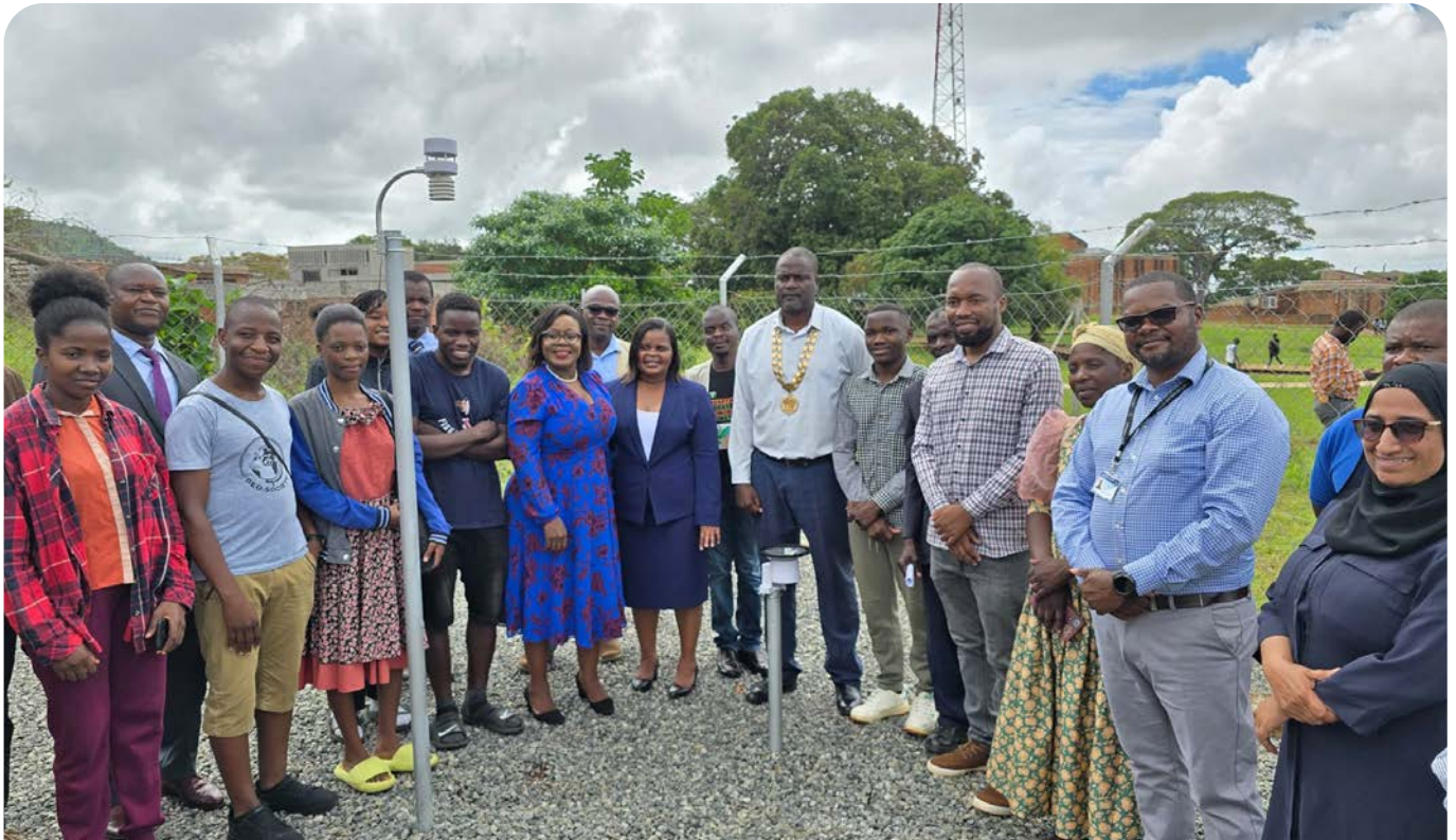
Oxfam staff, UNIMA staff, the Mayor for Zomba City, students and other officials at the weather station.