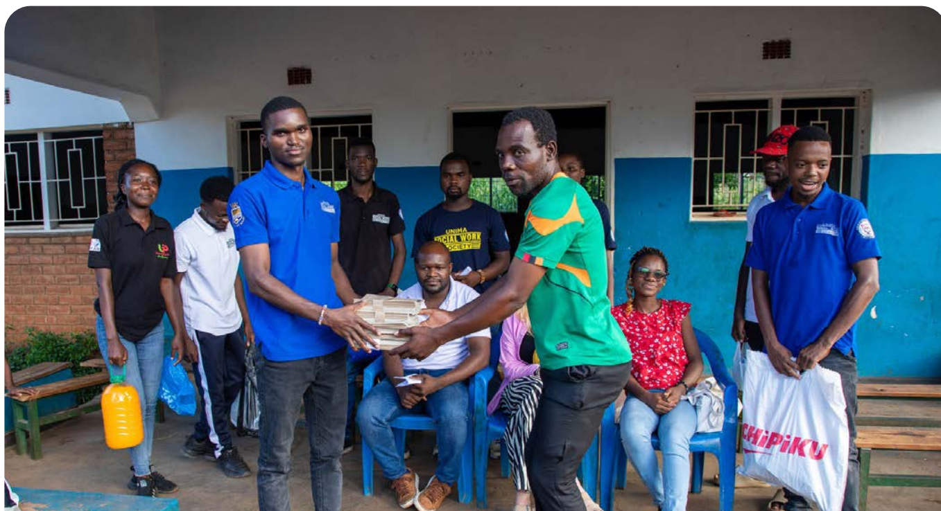
Handing over of the items.