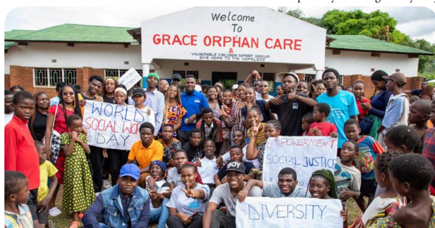
Students pose for a photo at the orphanage.

The event served as an important reminder of the positive impact Social Work students can have in their communities, demonstrating the value of solidarity and care for those in need.