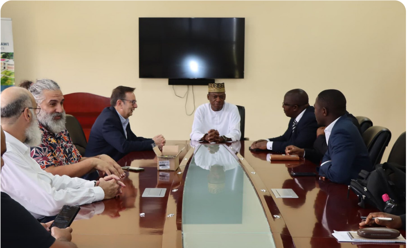
The UNIMA Deputy Vice-Chancellor engages with participants at the workshop.